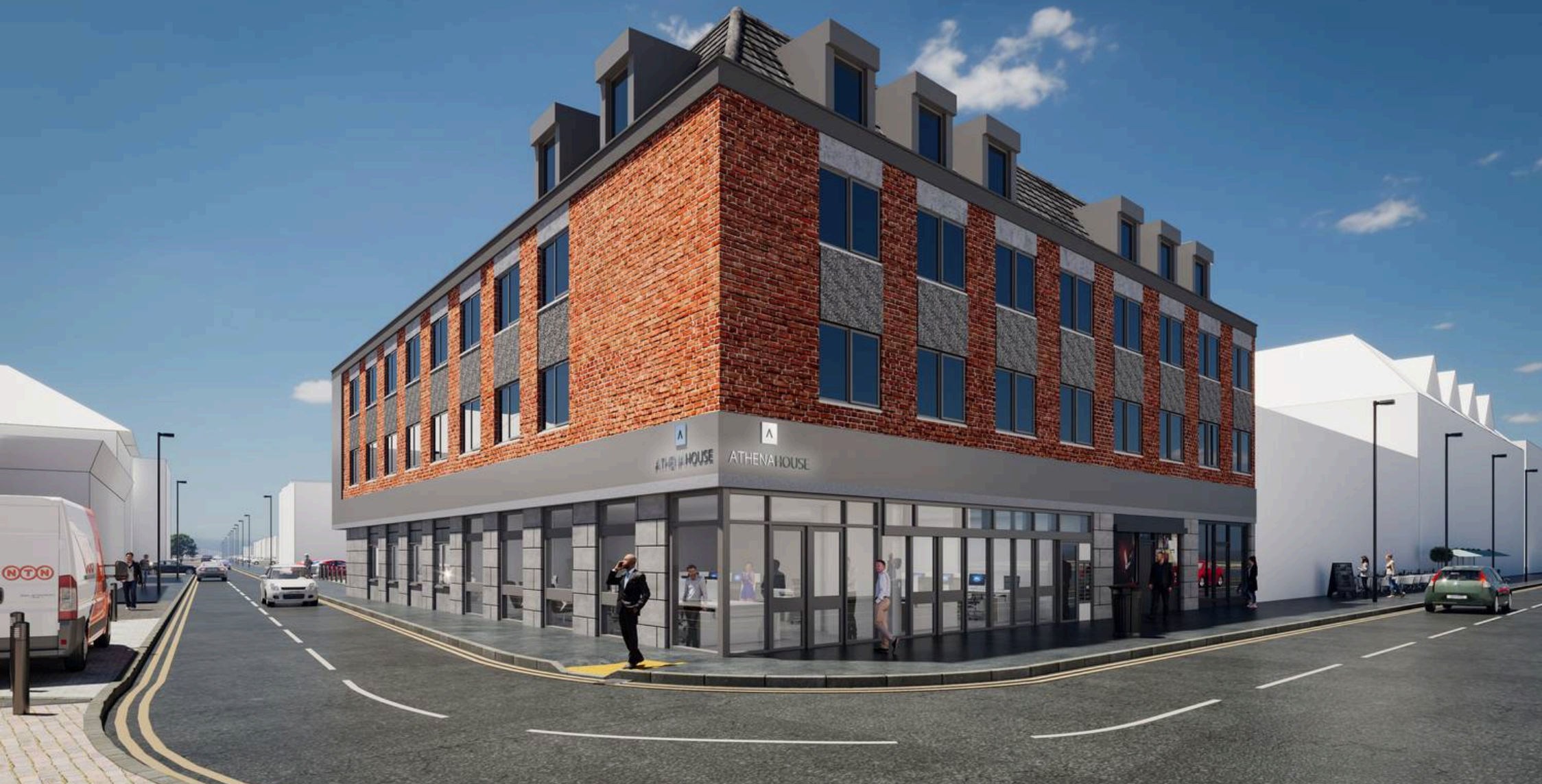
Athena House, High Street, Horley