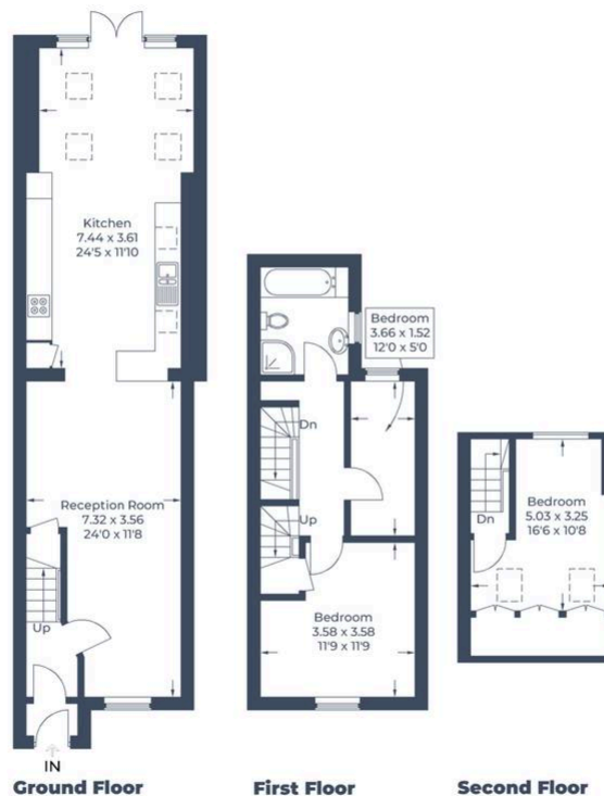
Illustration for identification purposes only, measurements are approximate, not to scale. © CJ Property Marketing Produced for Trend & Thomas