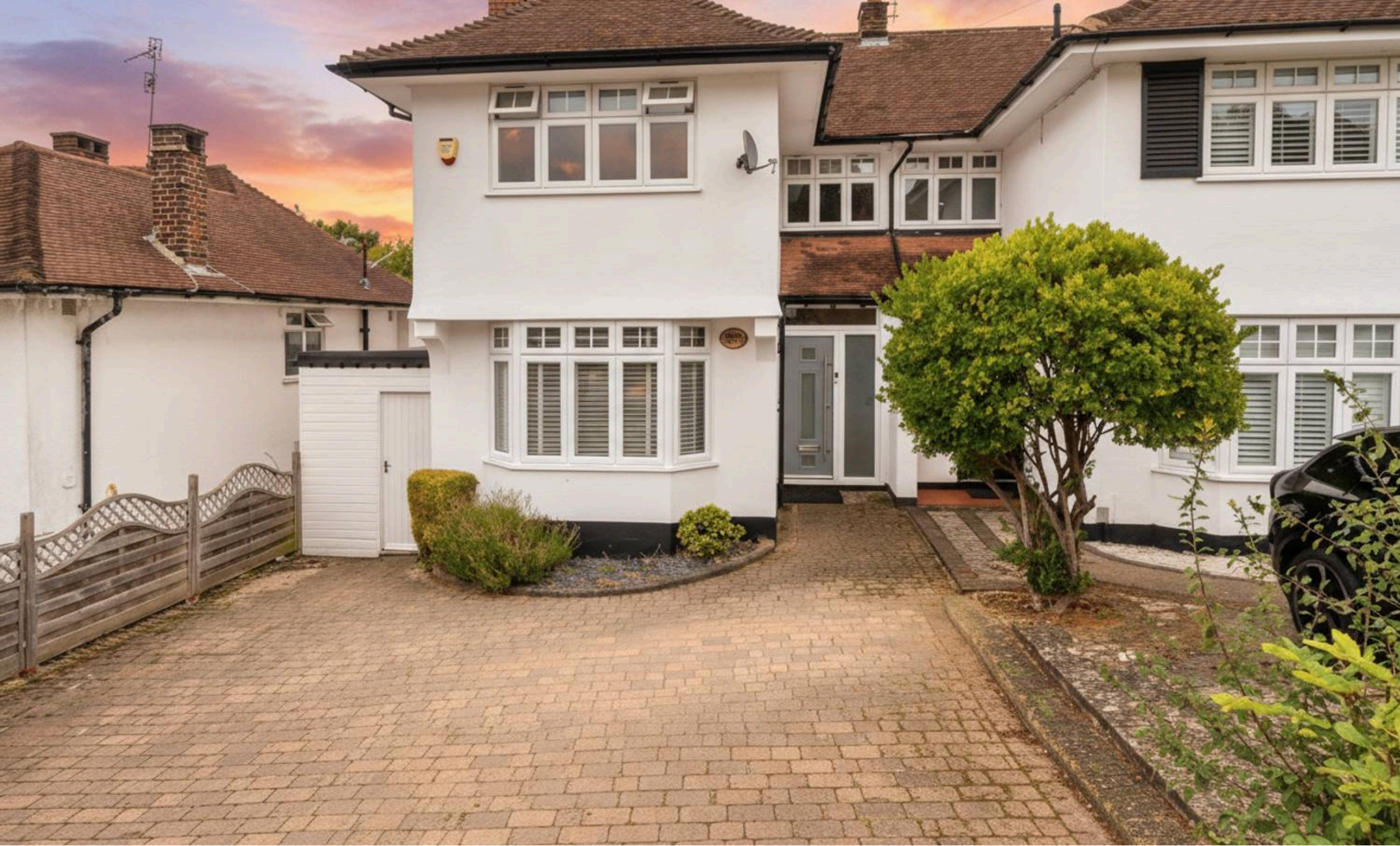
Hillcroft Crescent, Watford, WD19 4PB Guide Price £670,000 | Freehold