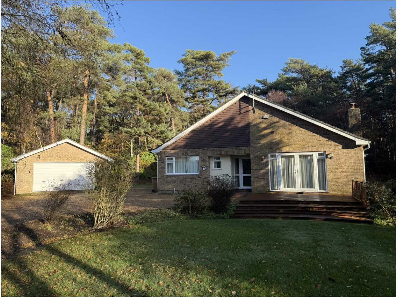
19 The Birches | South Wootton | King's Lynn