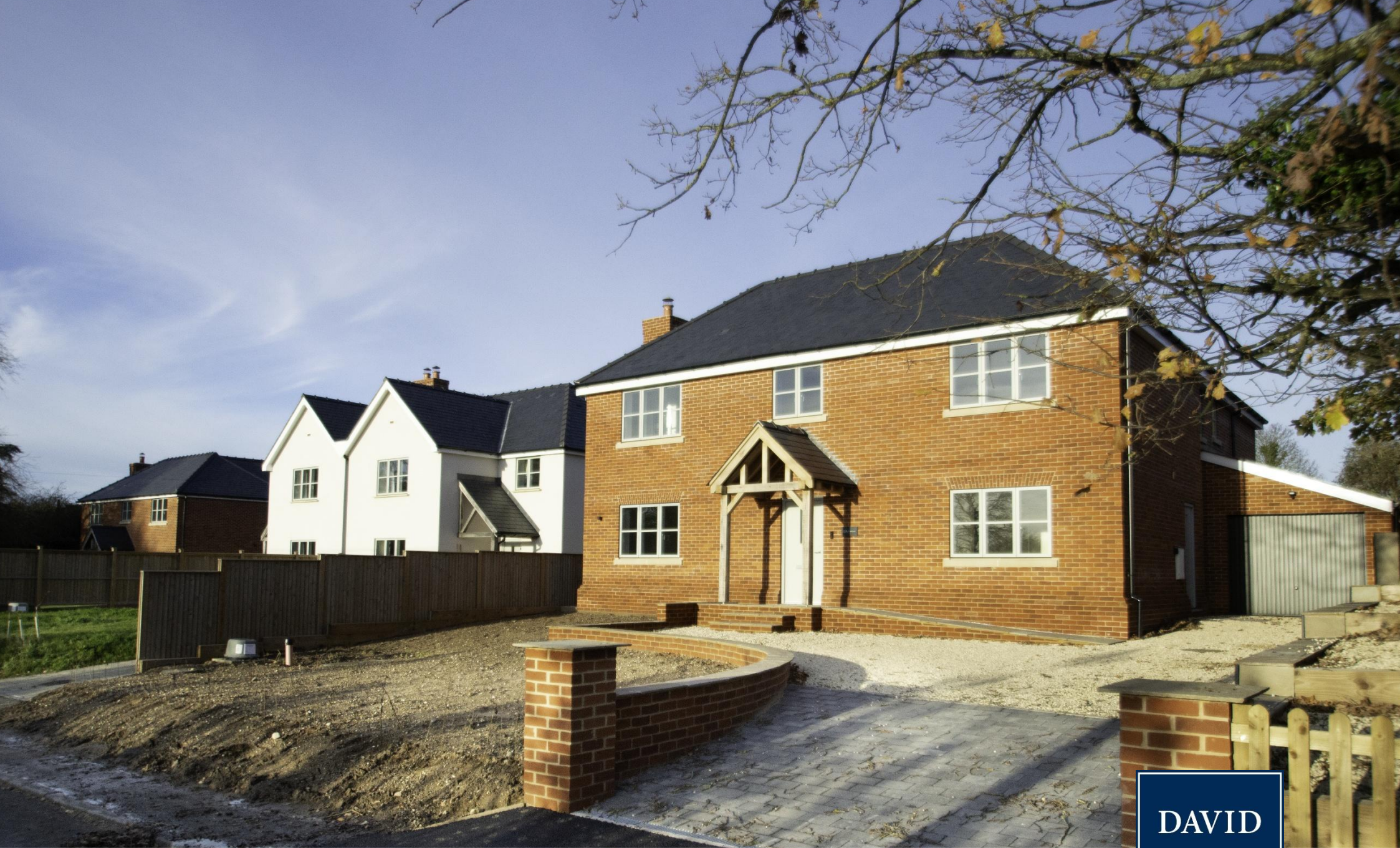
Jasmine House, 52A Main Street Westley Waterless, Cambridgeshire