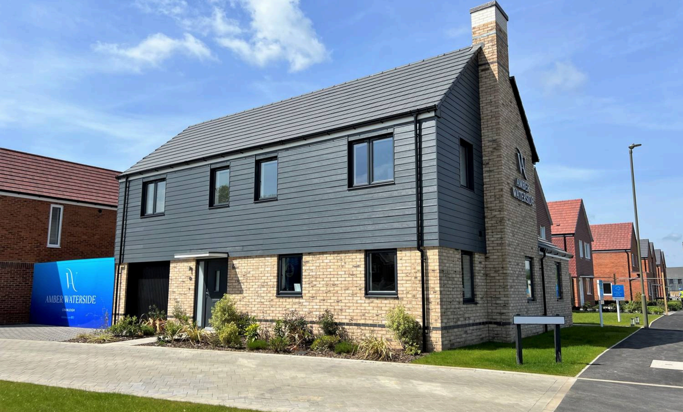
Plot 3 Amber Waterside, Cranleigh £650,000