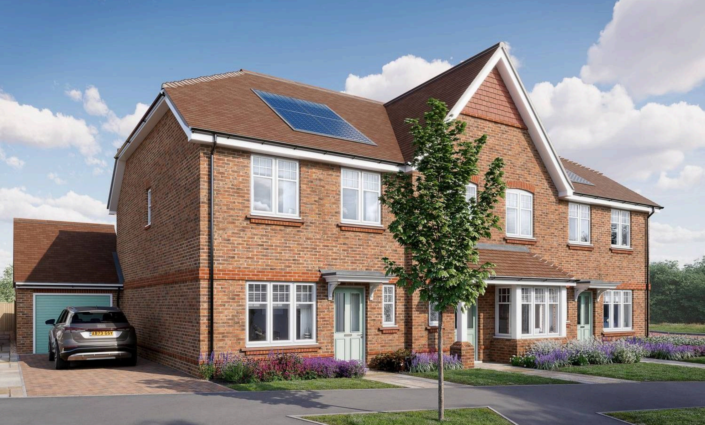
The Quince, Leighwood Fields, Cranleigh £685,000