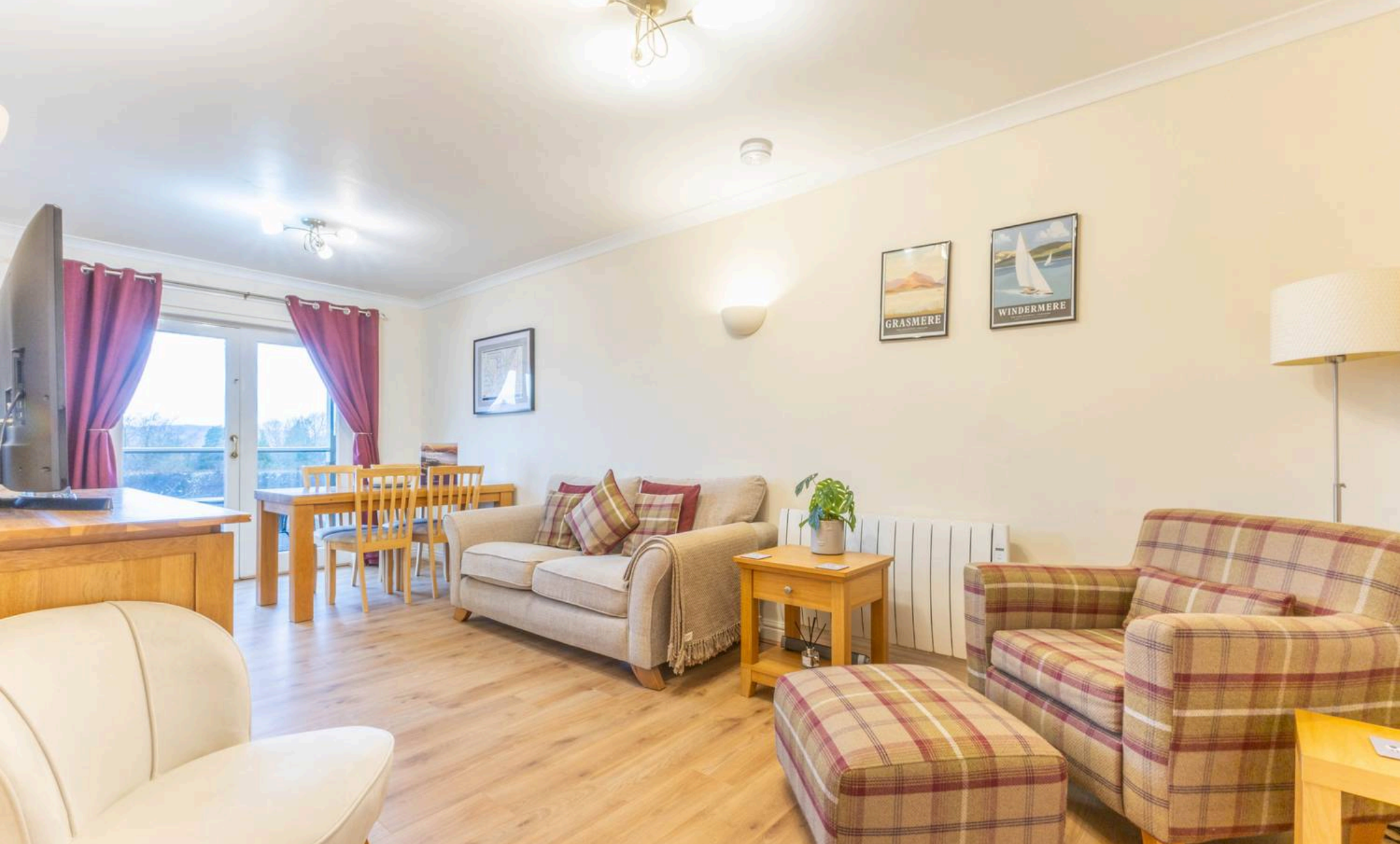
Flat 15, College Gate Elleray Road, Windermere £240,000