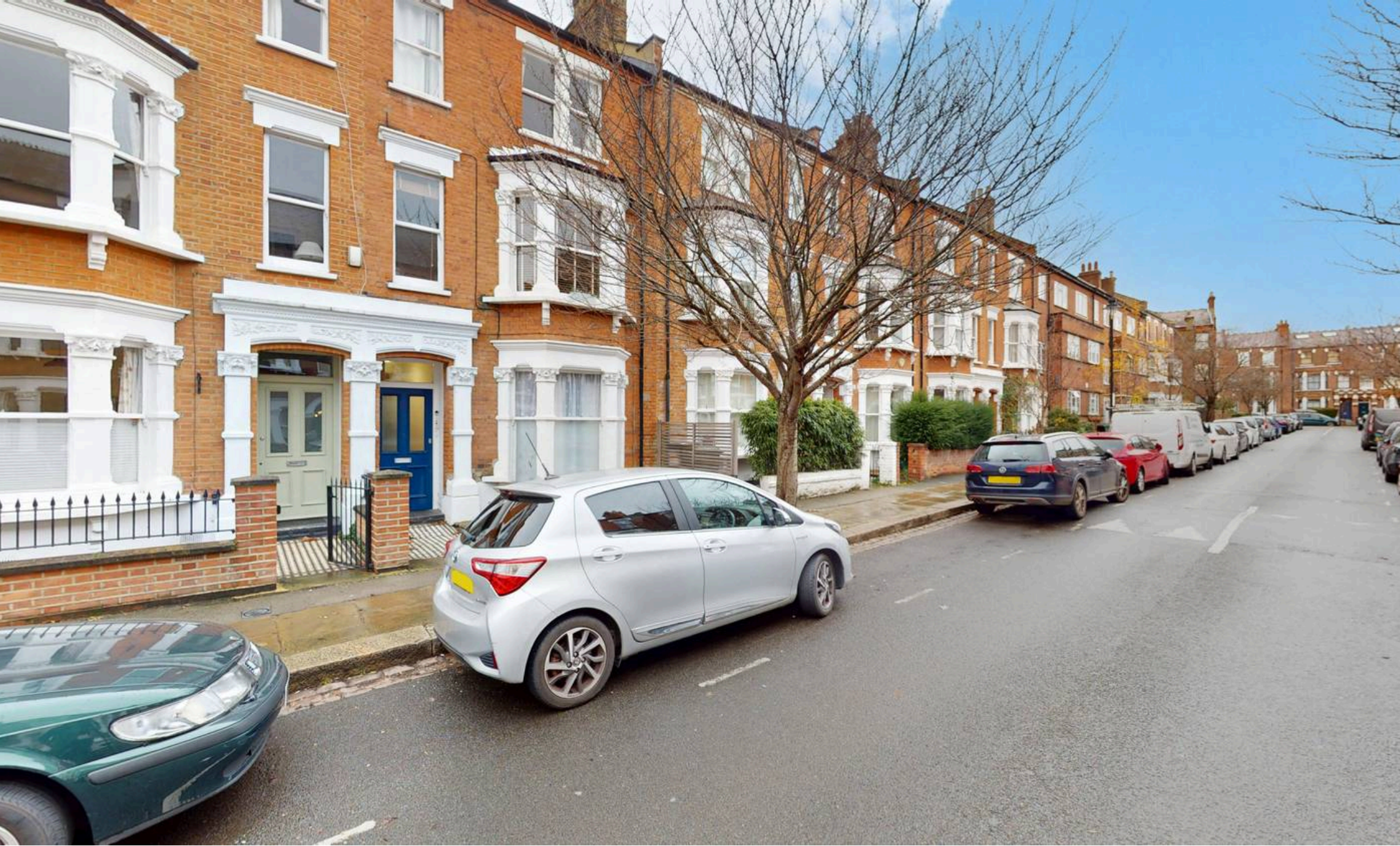
Mackeson Road, London, Nw3 £2,400 pcm