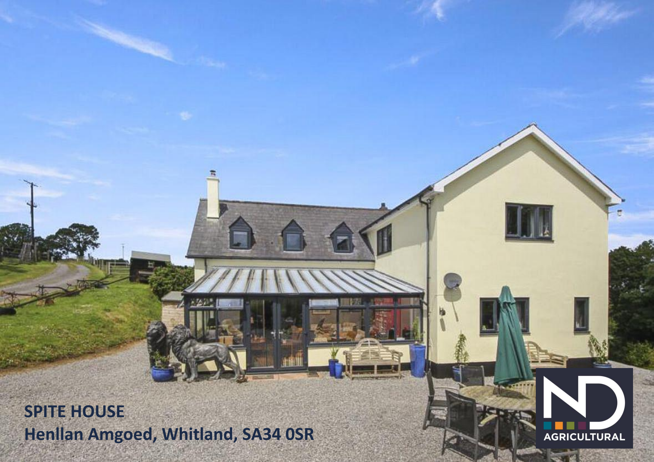
SPITE HOUSE Henllan Amgoed, Whitland, SA34 0SR