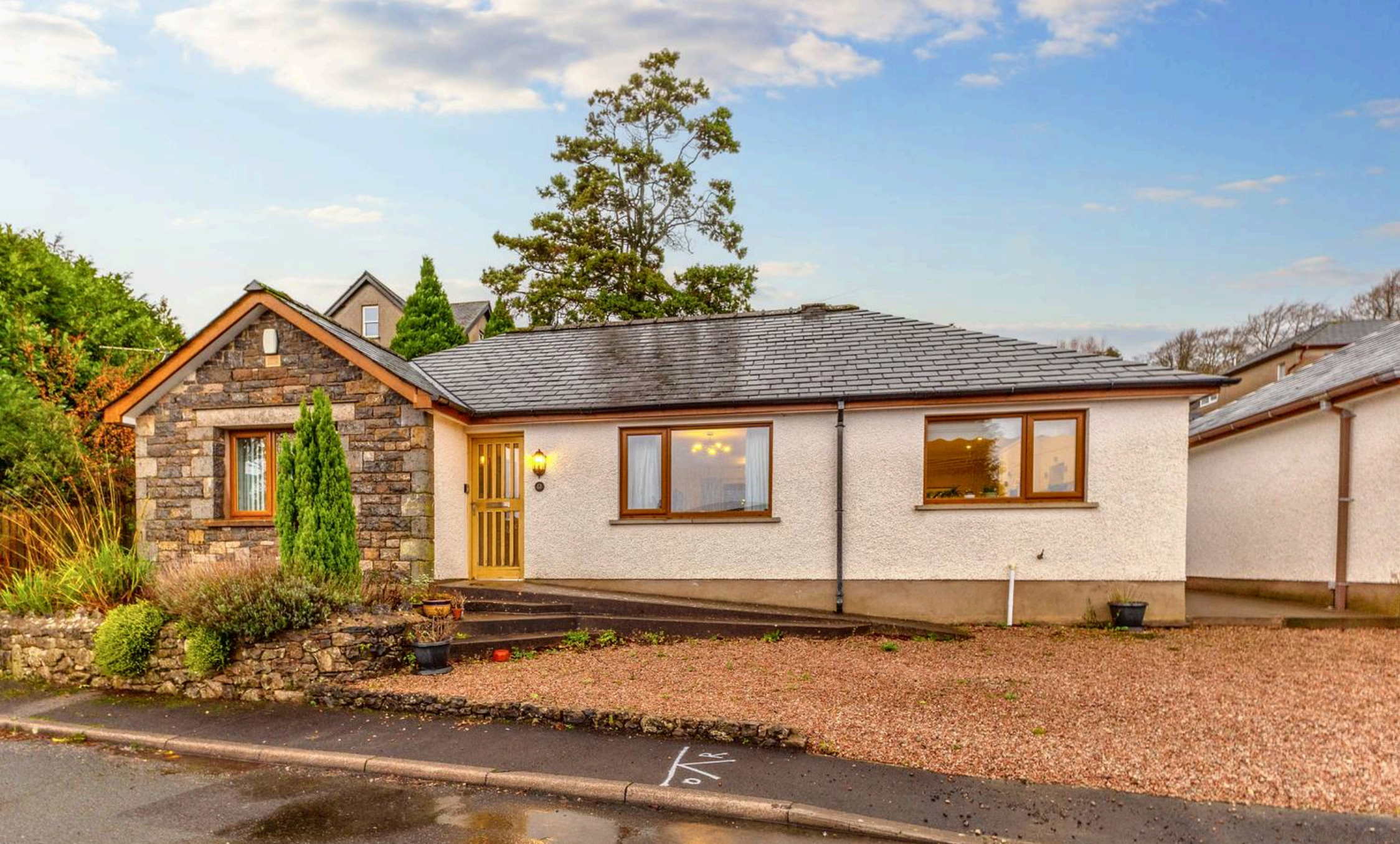
12 Westcliffe Gardens, Grange-Over-Sands £360,000