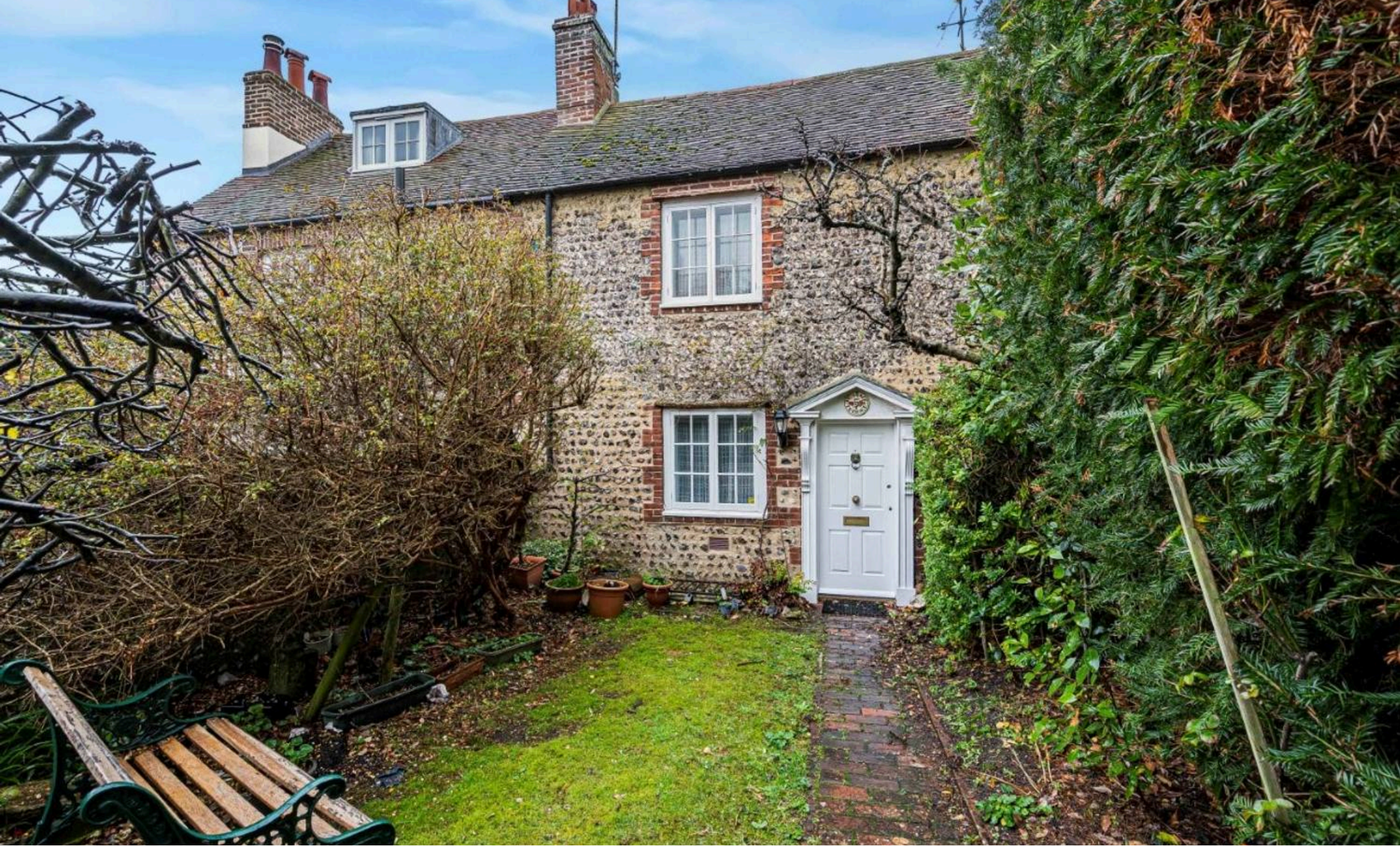
5 Vicarage Terrace, Rottingdean, BN2 7HT £500,000