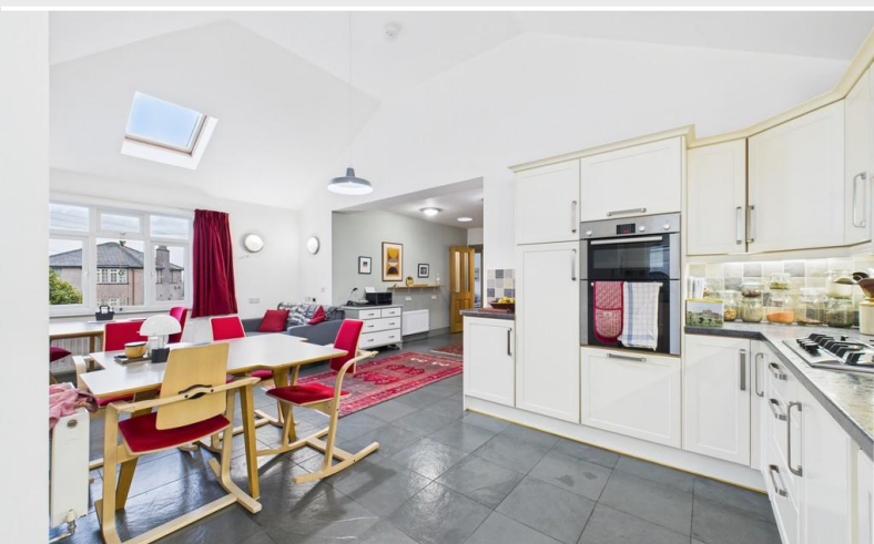
Kitchen Dining Room