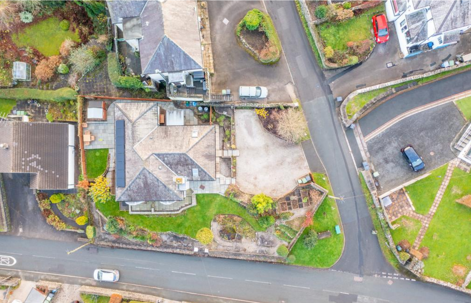
16 Briery Bank