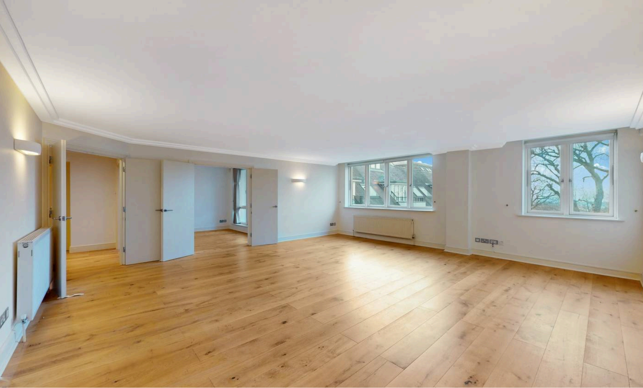
Westfield, 15 Kidderpore Avenue £7,500 pcm