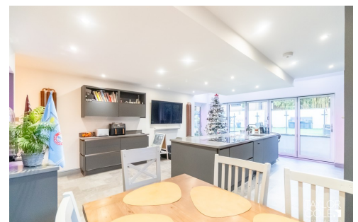
Parsons Walk Clifton Campville, Tamworth, B79 0DL