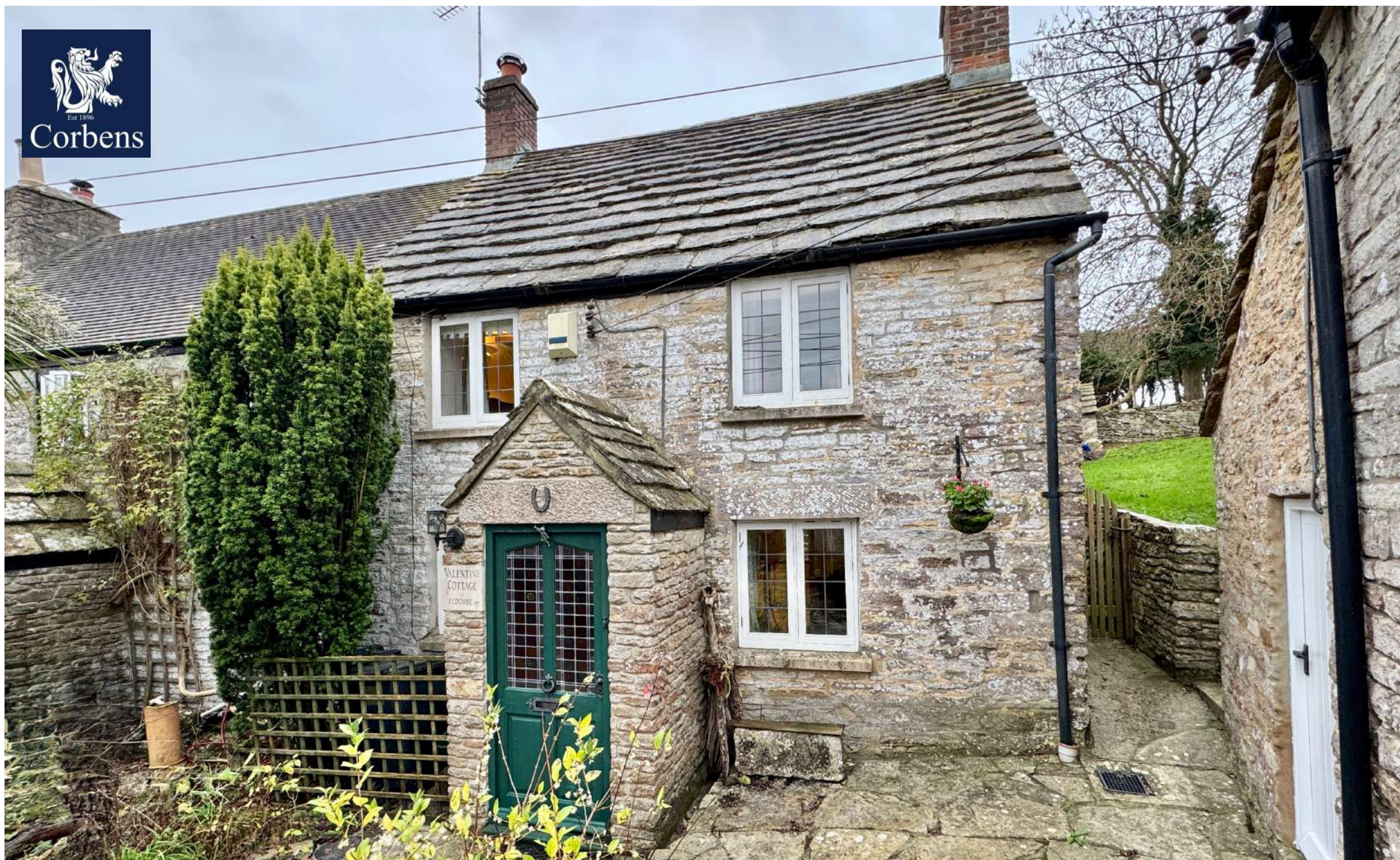
VALENTINE COTTAGE, 3 COOMBE COURT, COOMBE, SWANAGE £425,000 FREEHOLD