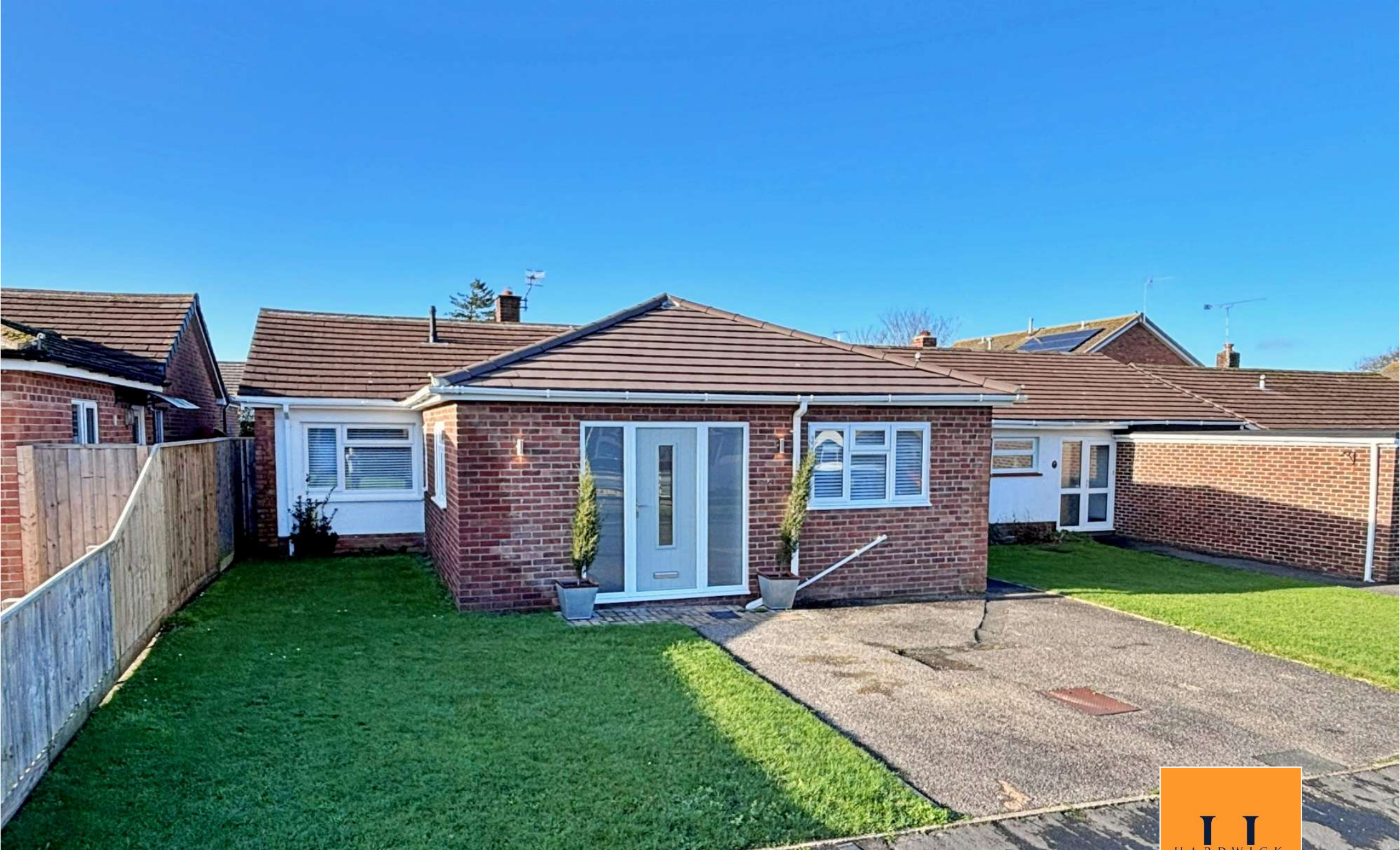
16 Folly Lane Wool, Wareham, BH20 6DS