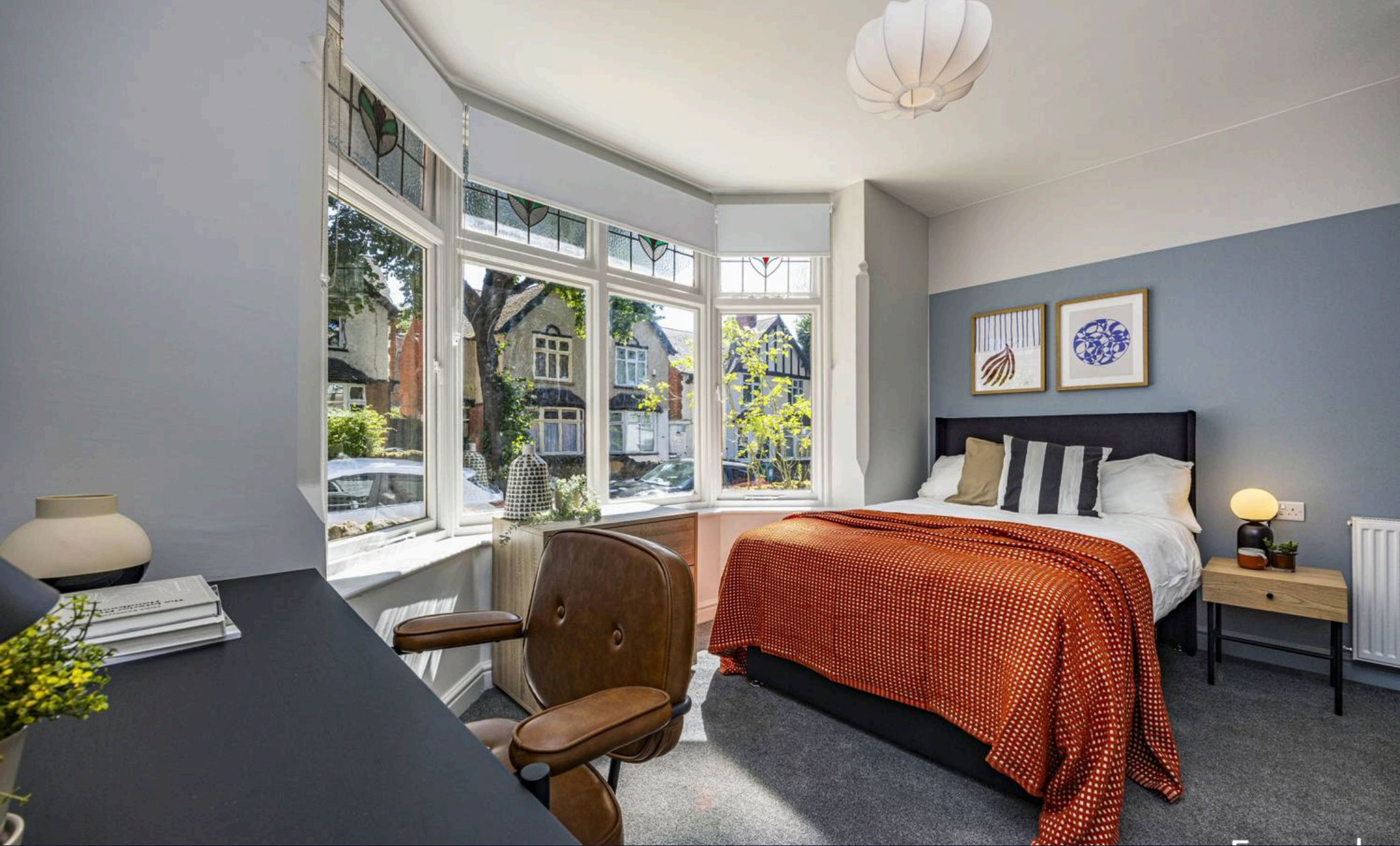
Room 1, Highfield Road, Nottingham