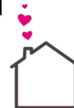
Illustration for identification purposes only, measurements are approximate, not to scale. Fourlabs.co © (ID1264404)

home sweet home estate agents your local property experts