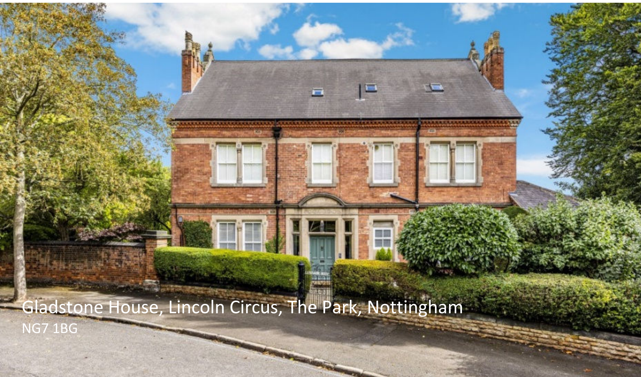
Gladstone House, Lincoln Circus, The Park, Nottingham NG7 1BG

Consultative Estate Agents with Integrity