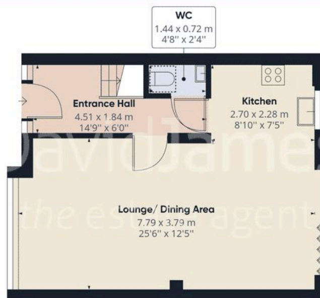
Floor 0 Building 1