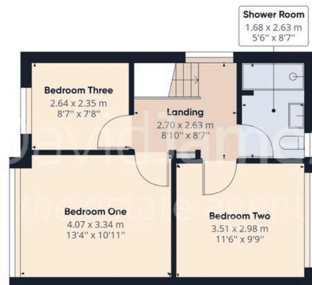
Floor 1 Building 1