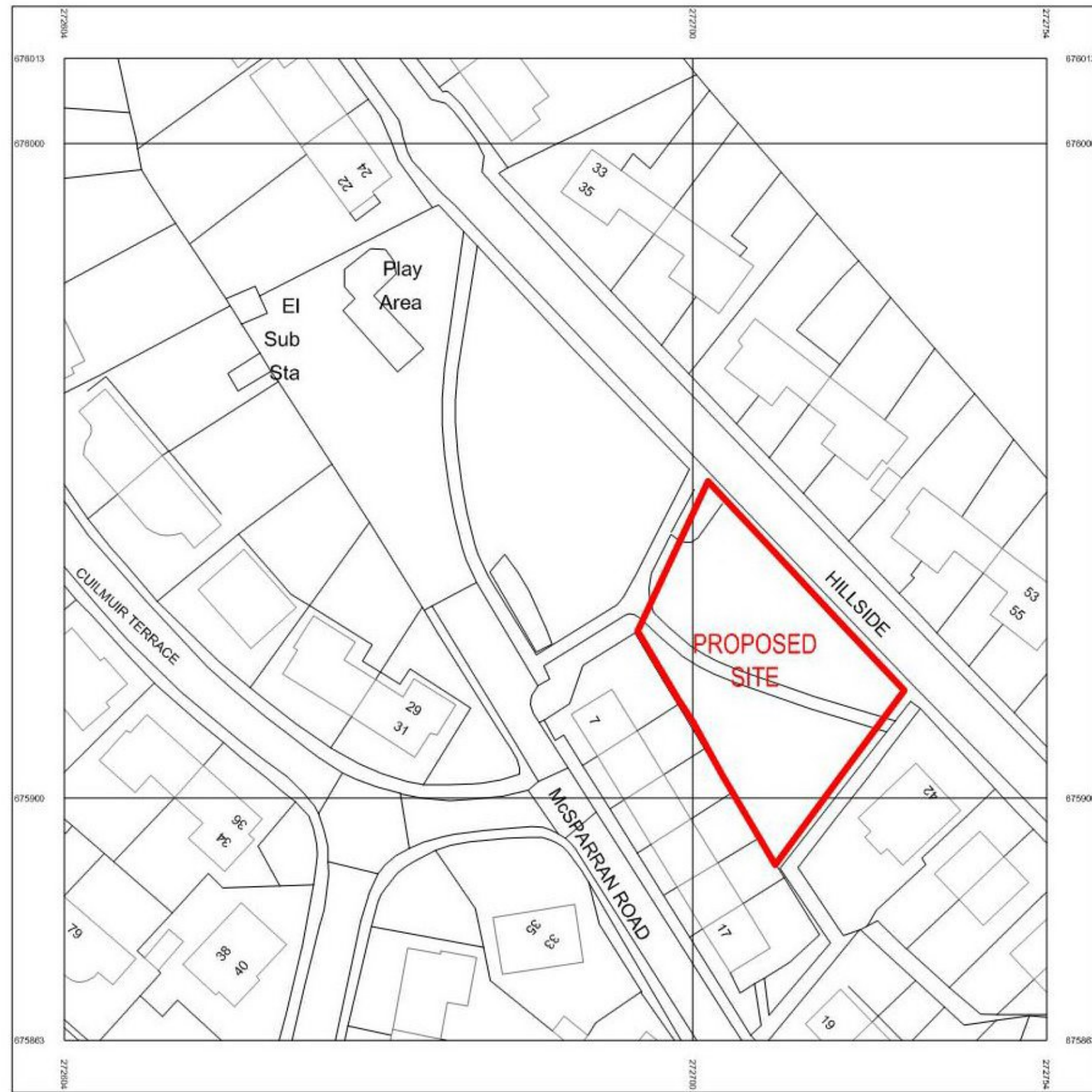
Location Plan 1:1000