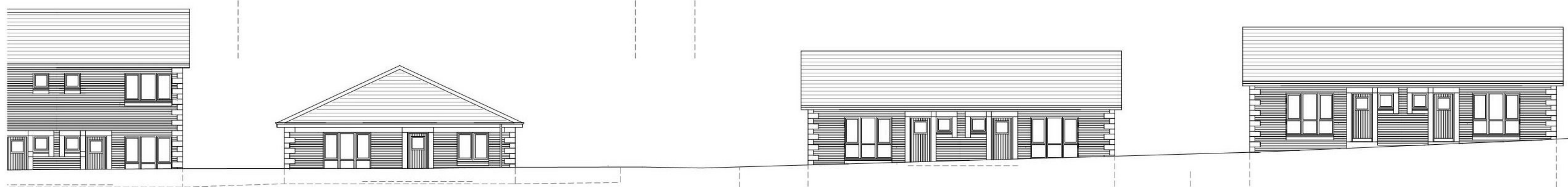
Proposed Streetscape 1:100