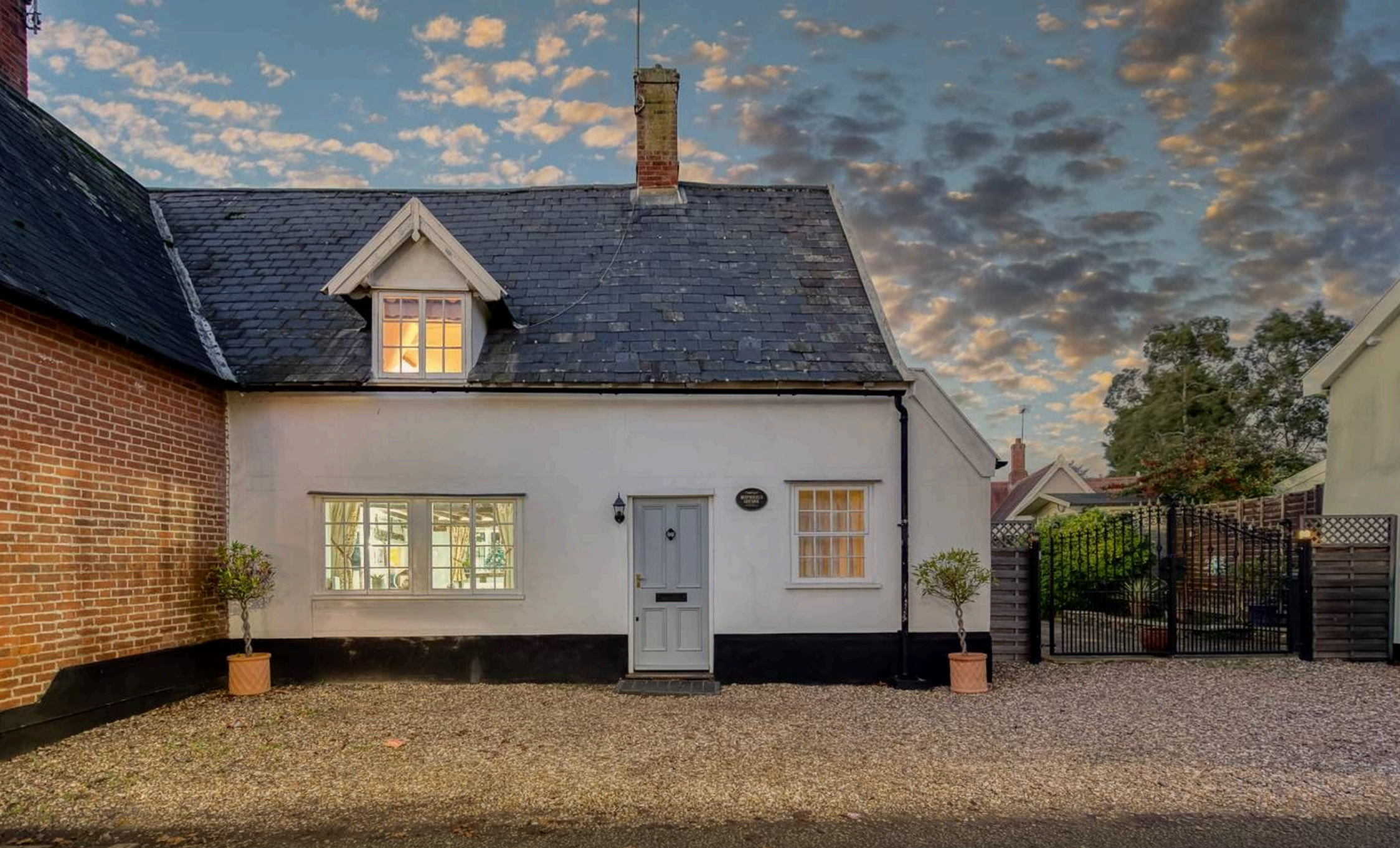
Bedingfield Cottage Wellington Road, Eye