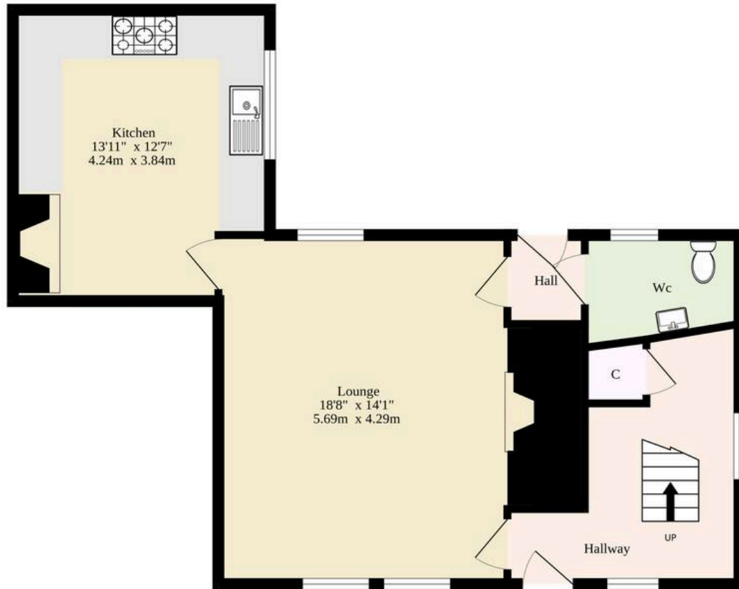
Ground Floor 599 sq.ft. (55.6 sq.m.) approx.