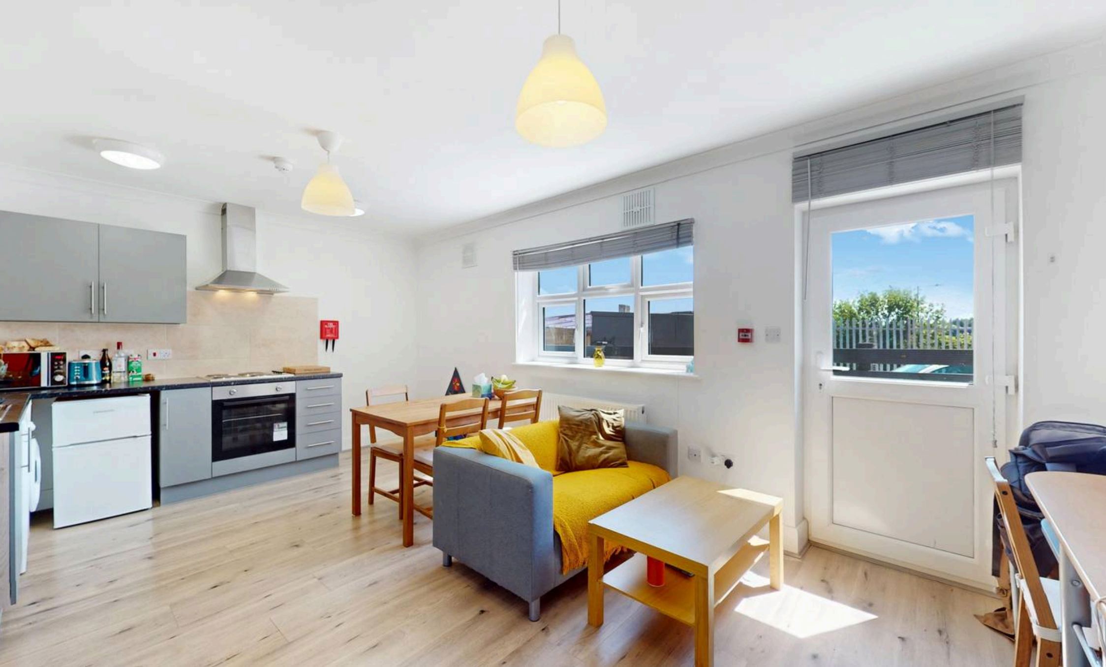
Burnley Road, London, NW10 £1,550 pcm