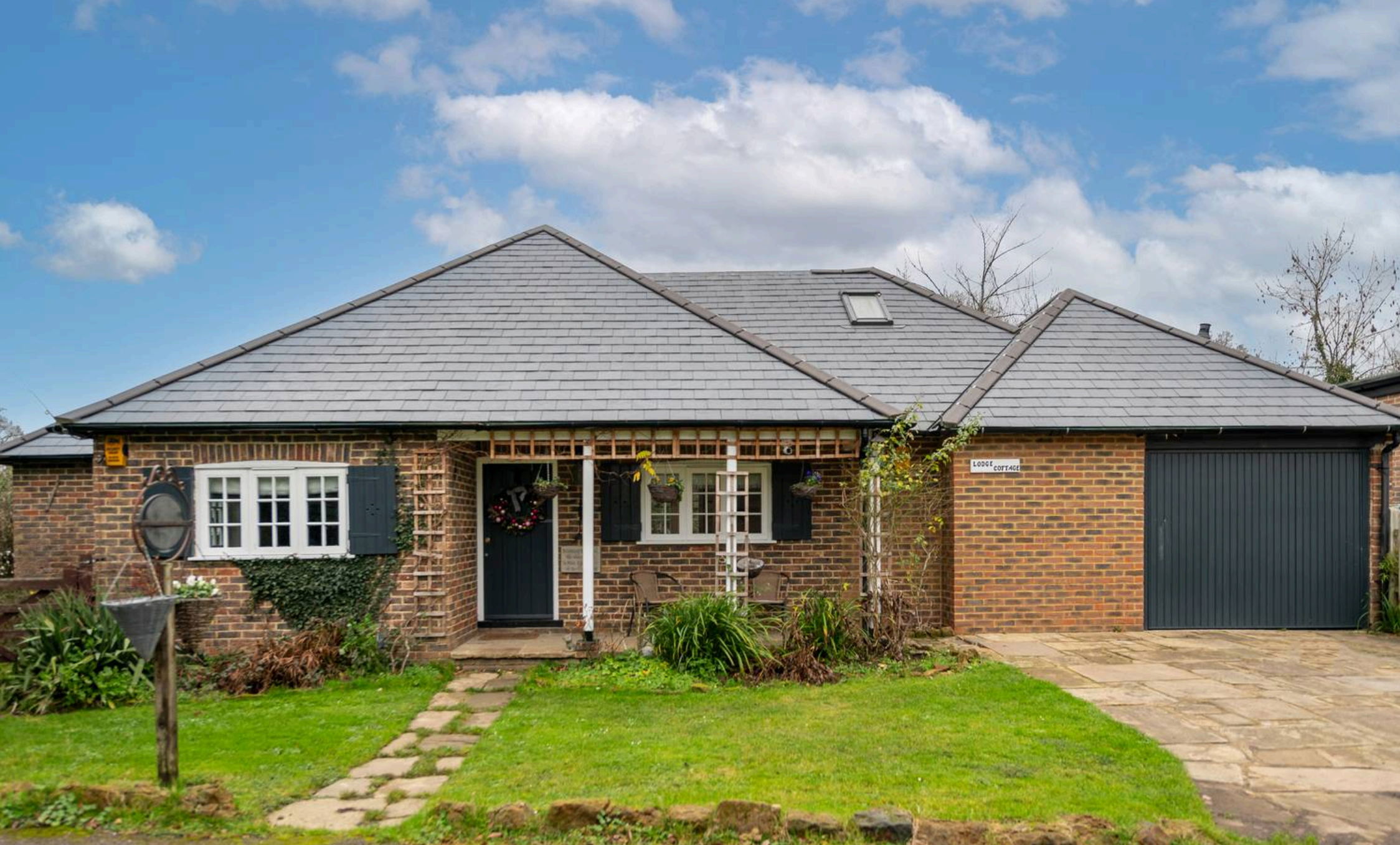
Lodge Cottage, Crab Hill Lane. South Nutfield.