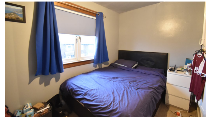
11 Birkhill Crescent