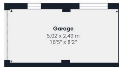
Floor 1 Building 2