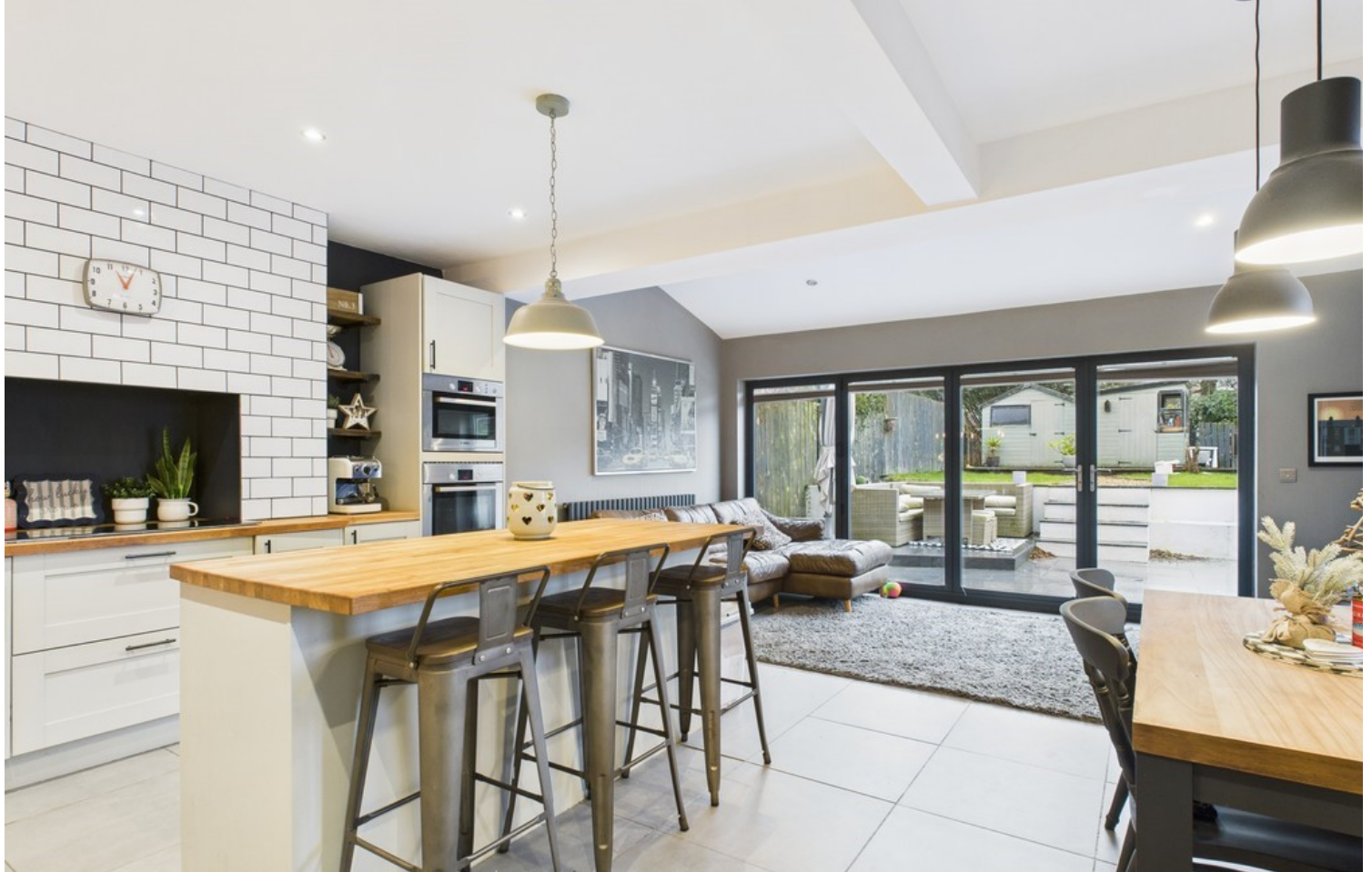
Kitchen Living Area