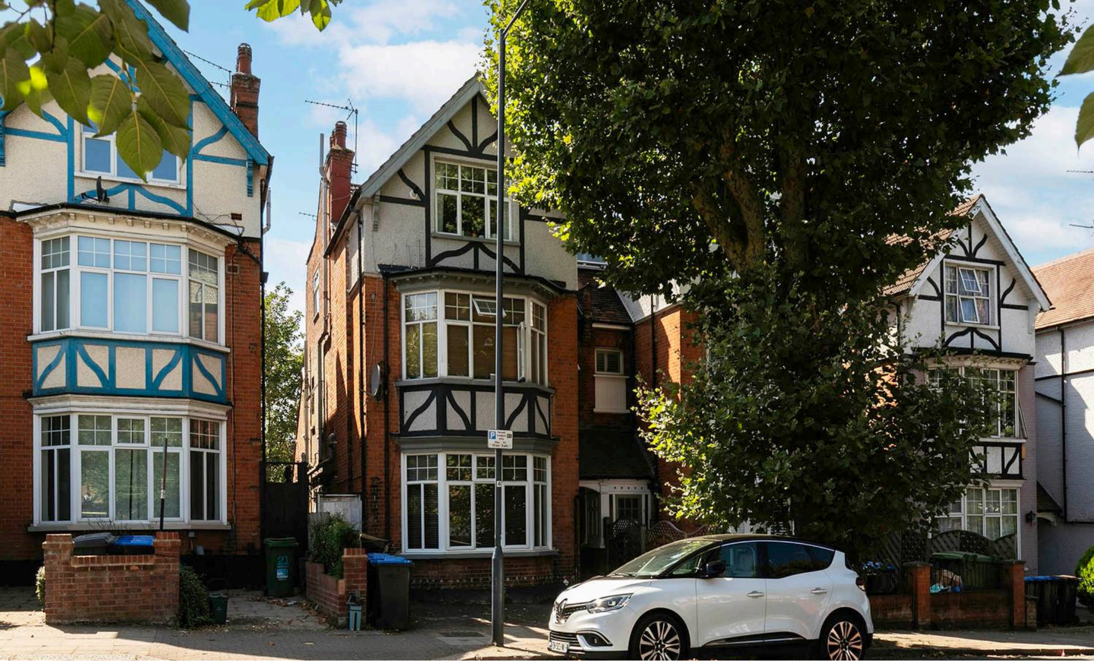
Staverton Road, London, NW2 £1,850 pcm