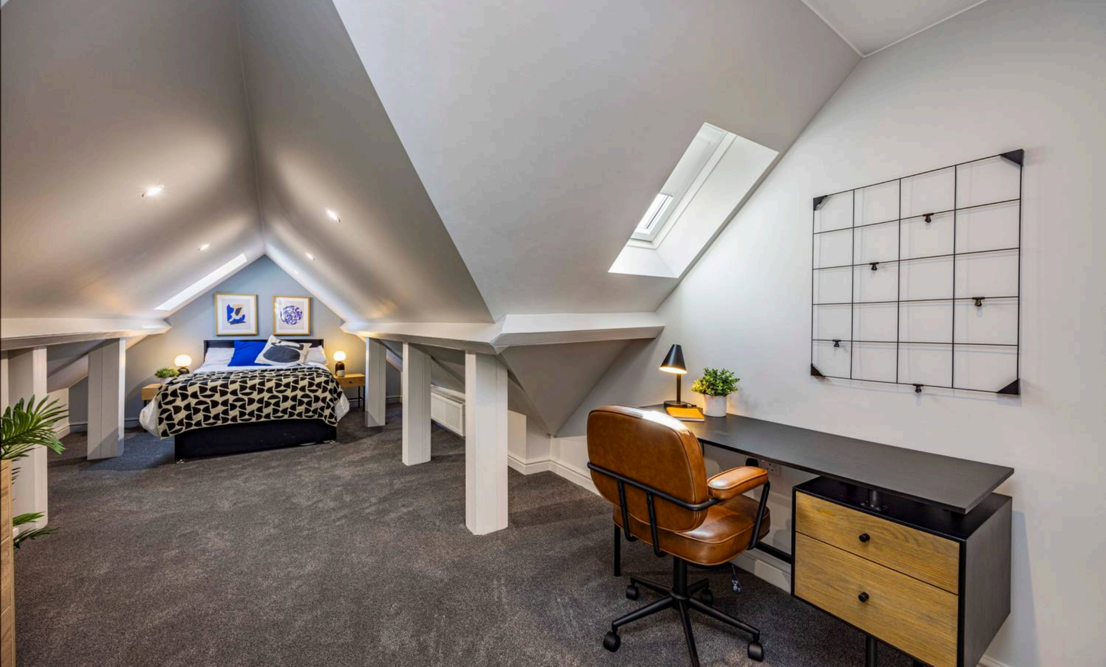
Room 6, Highfield Road, Nottingham £600 pcm