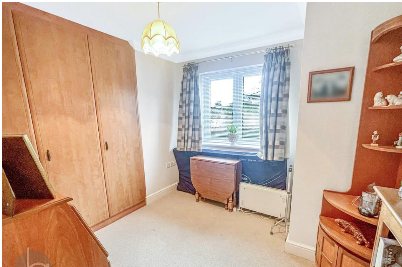
Church Road, Tiptree CO5 0SU