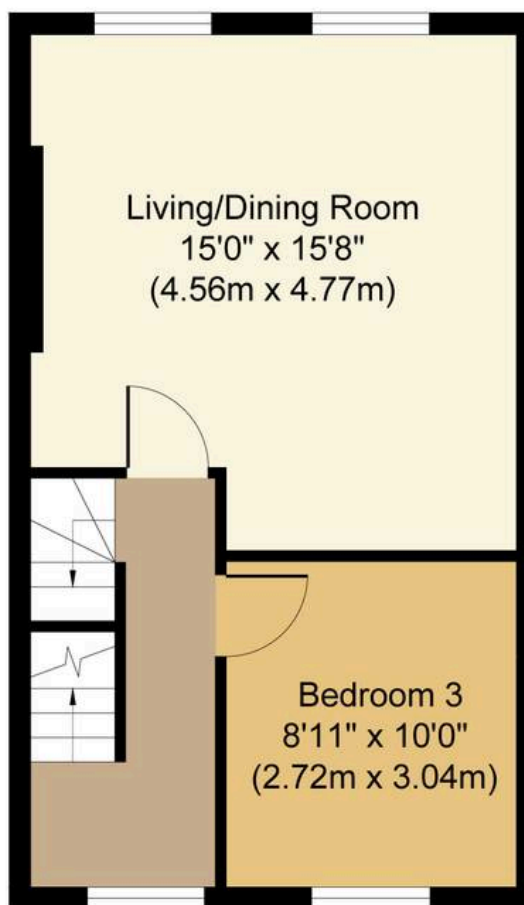
First Floor Approximate Floor Area 381 sq. ft (35.40 sq. m)