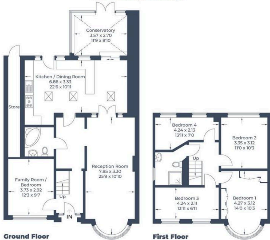
Illustration for identification purposes only, measurements are approximate, not to scale.