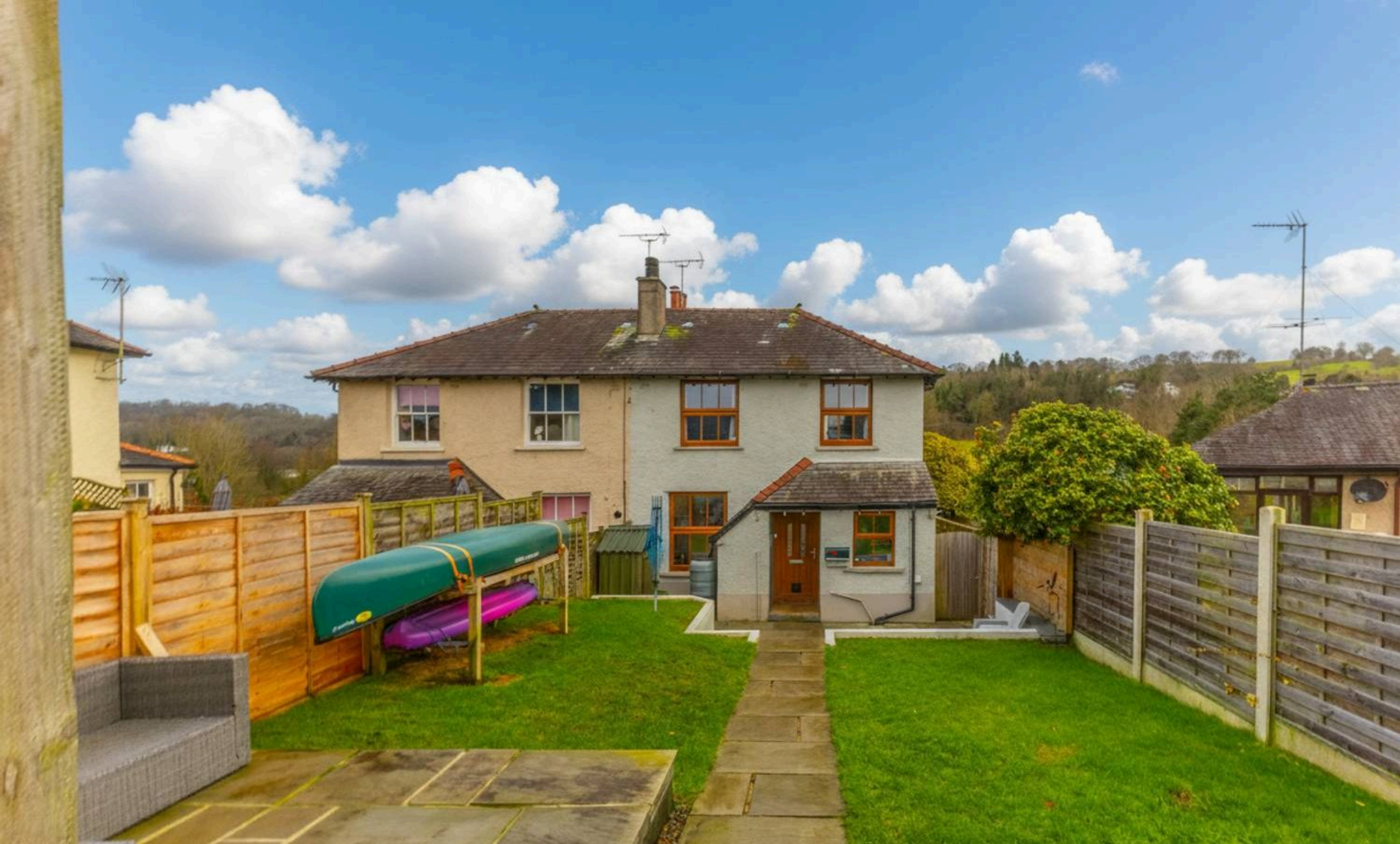
Claremont, Lindale £335,000