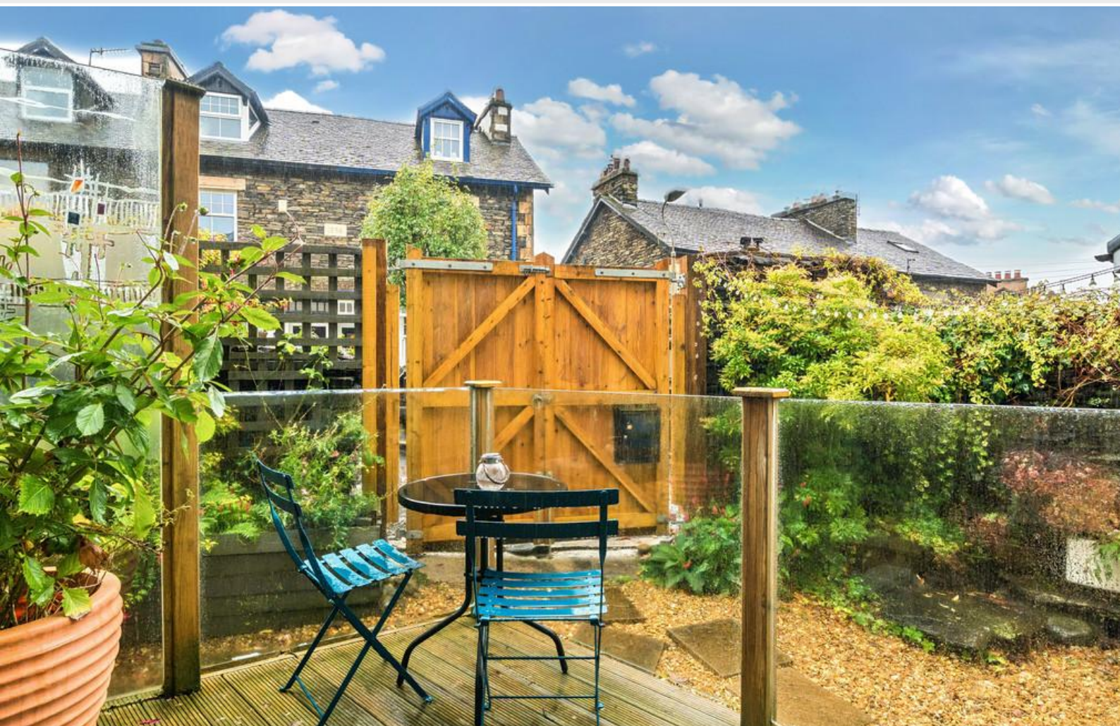
Rear Patio and view