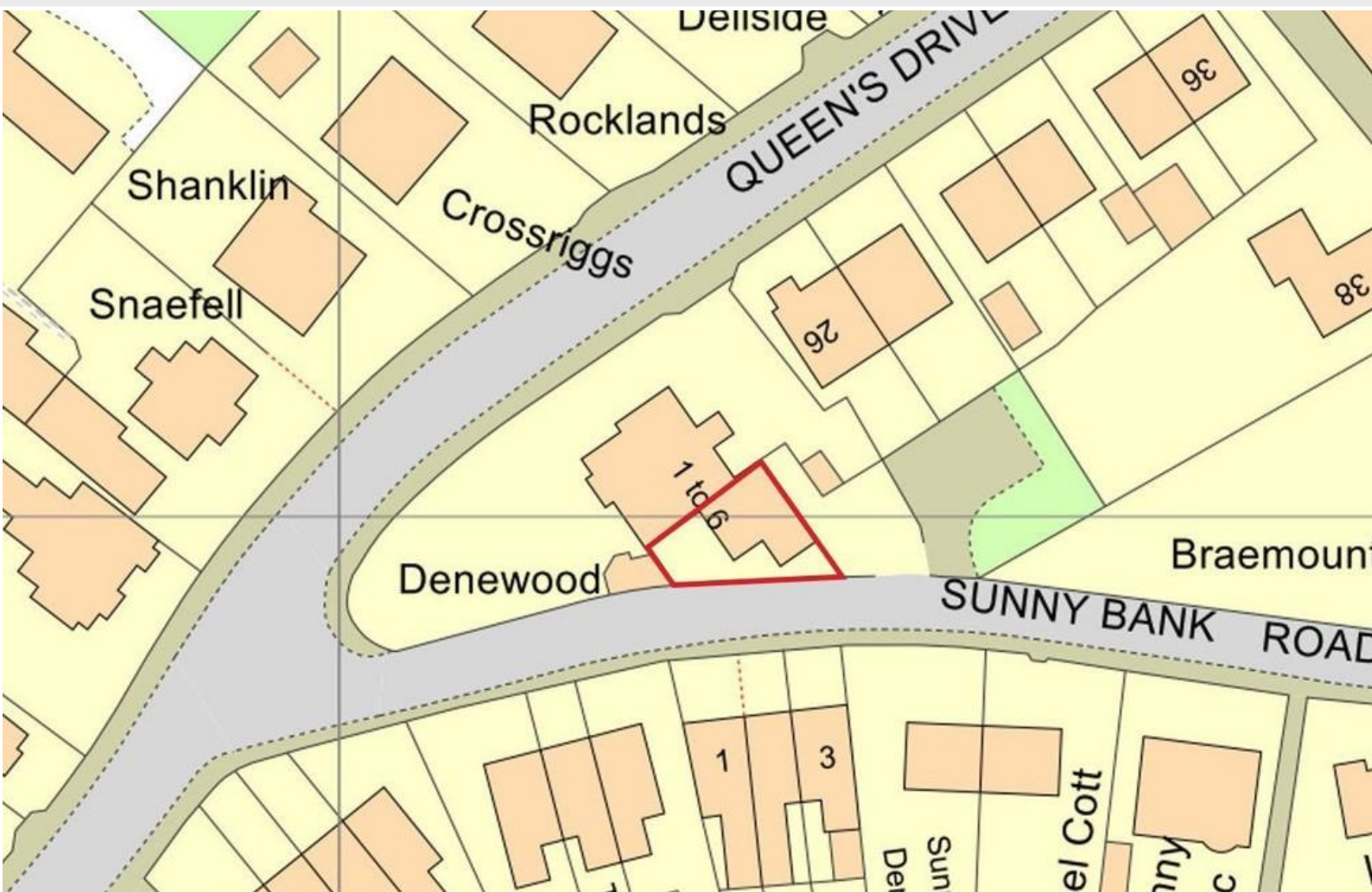
Ordnance Survey Map

Request a Viewing Online or Call 015394 44461