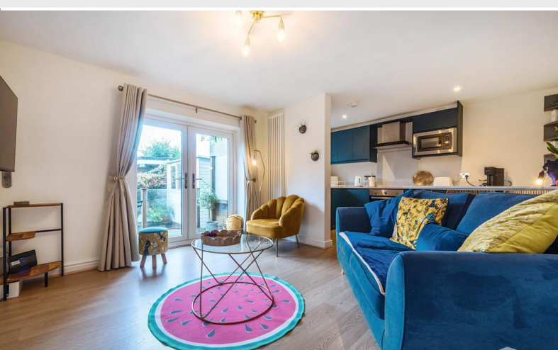
Open Plan Living area