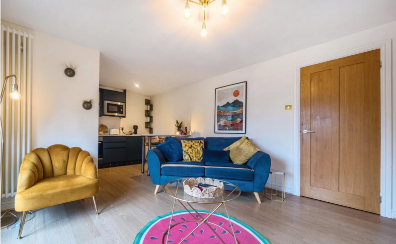
Open Plan living area