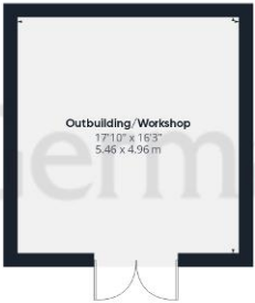
Ground Floor Building 3