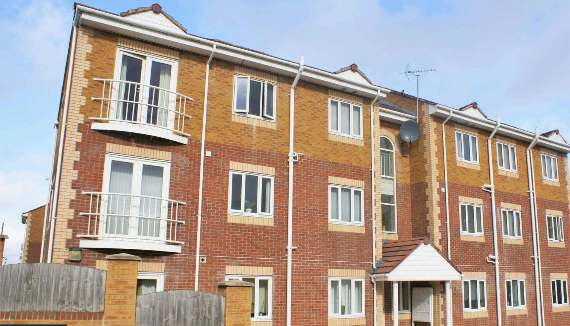
Apt 2, The Quays, Burscough £100,000