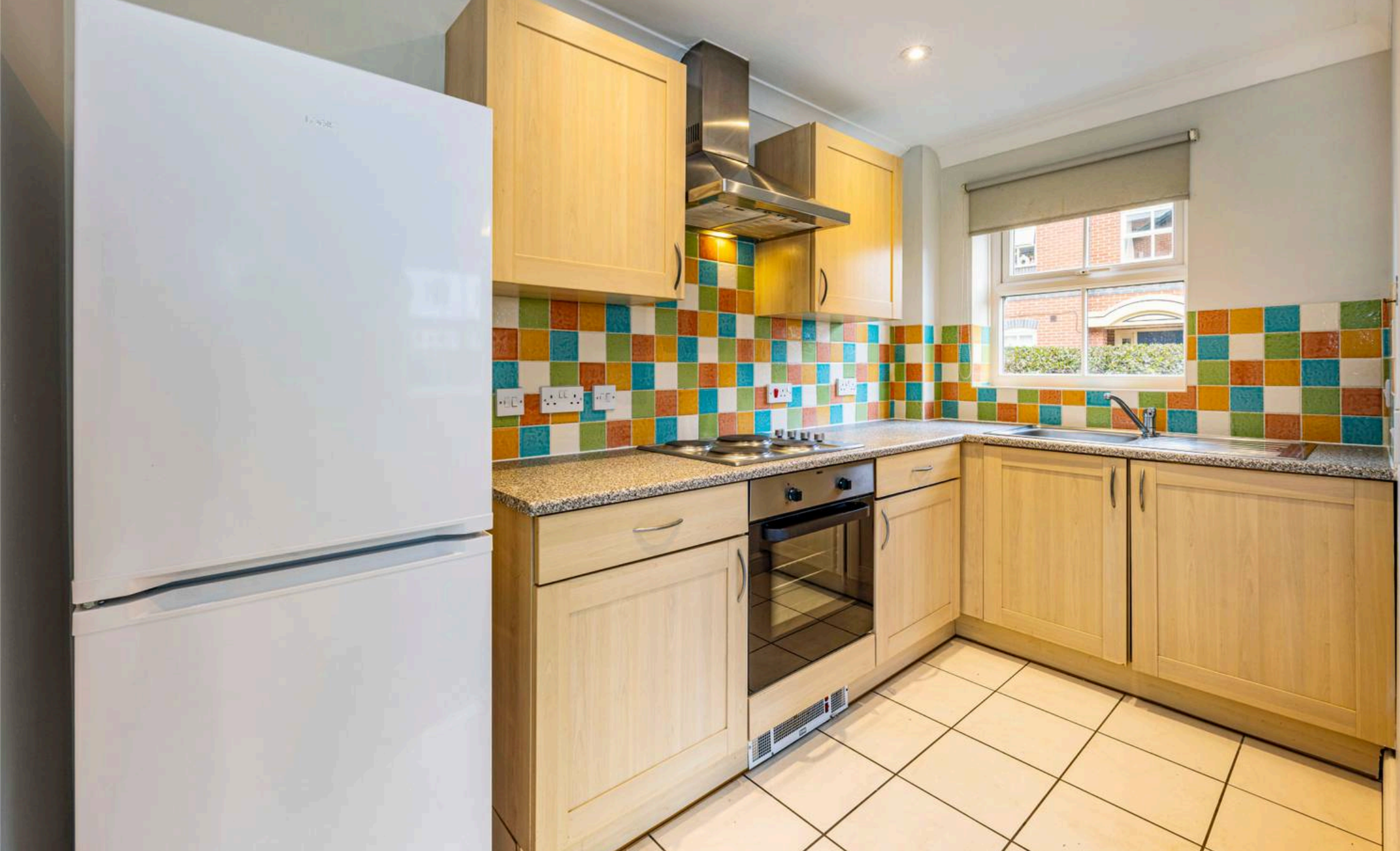
Apt 2, Holly Lodge Julian Road, West Bridgford £0