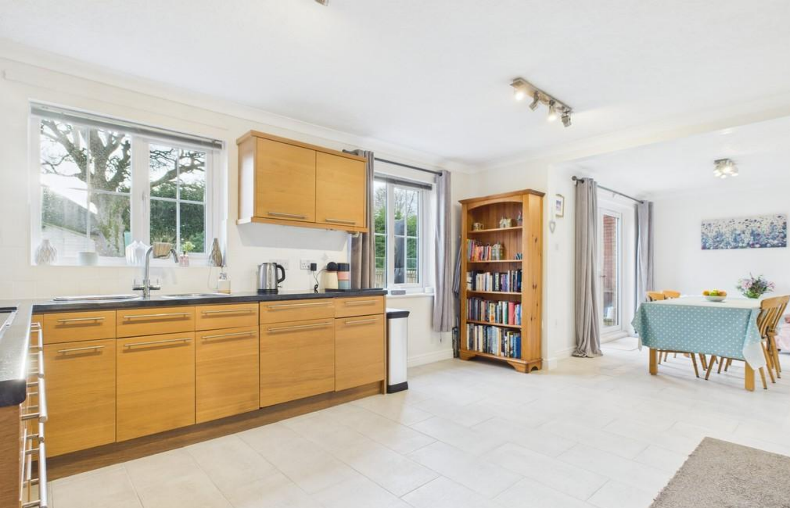
Kitchen/ Dining Room