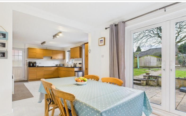
Kitchen/ Dining Room