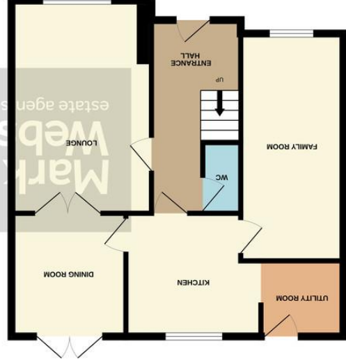
GROUND FLOOR 603 sq.ft. (56.1 sq.m.) approx.