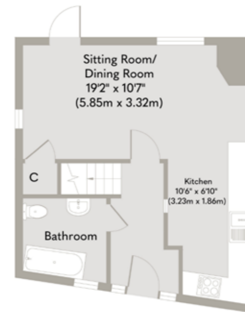
Ground Floor Approximate Floor Area 391 sq. ft (36.30 sq. m)