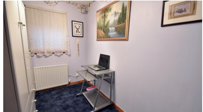
19 Almond Court