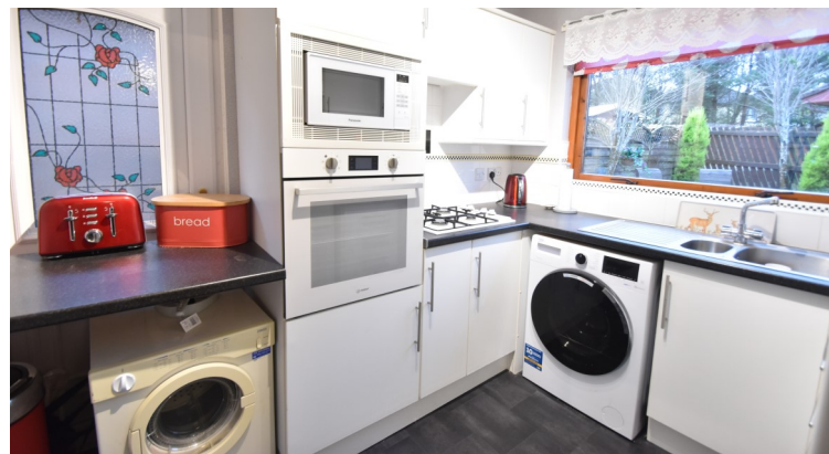
19 Almond Court

Viewings: Strictly by appointment through Caesar & Howie on 01506 435306 or email nk@caesar-howie.co.uk