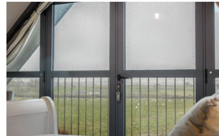
View from Principal Bedroom

“We love the views across the fields from both downstairs and upstairs.”