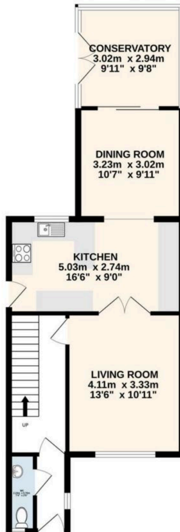
GROUND FLOOR 56.9 sq.m. (613 sq.ft.) approx.