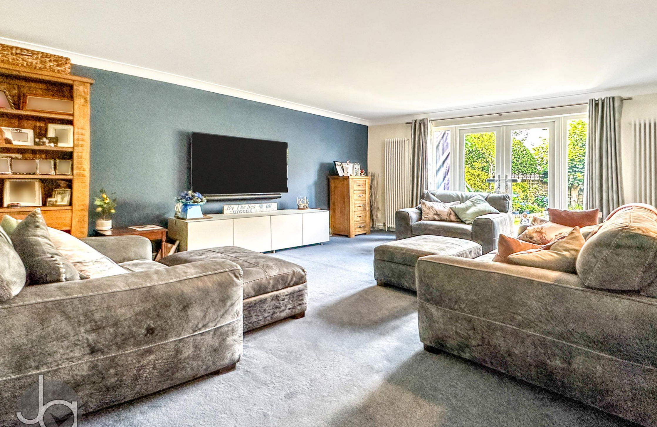
Bulford Lane, Black Notley, Braintree, CM77 8NN