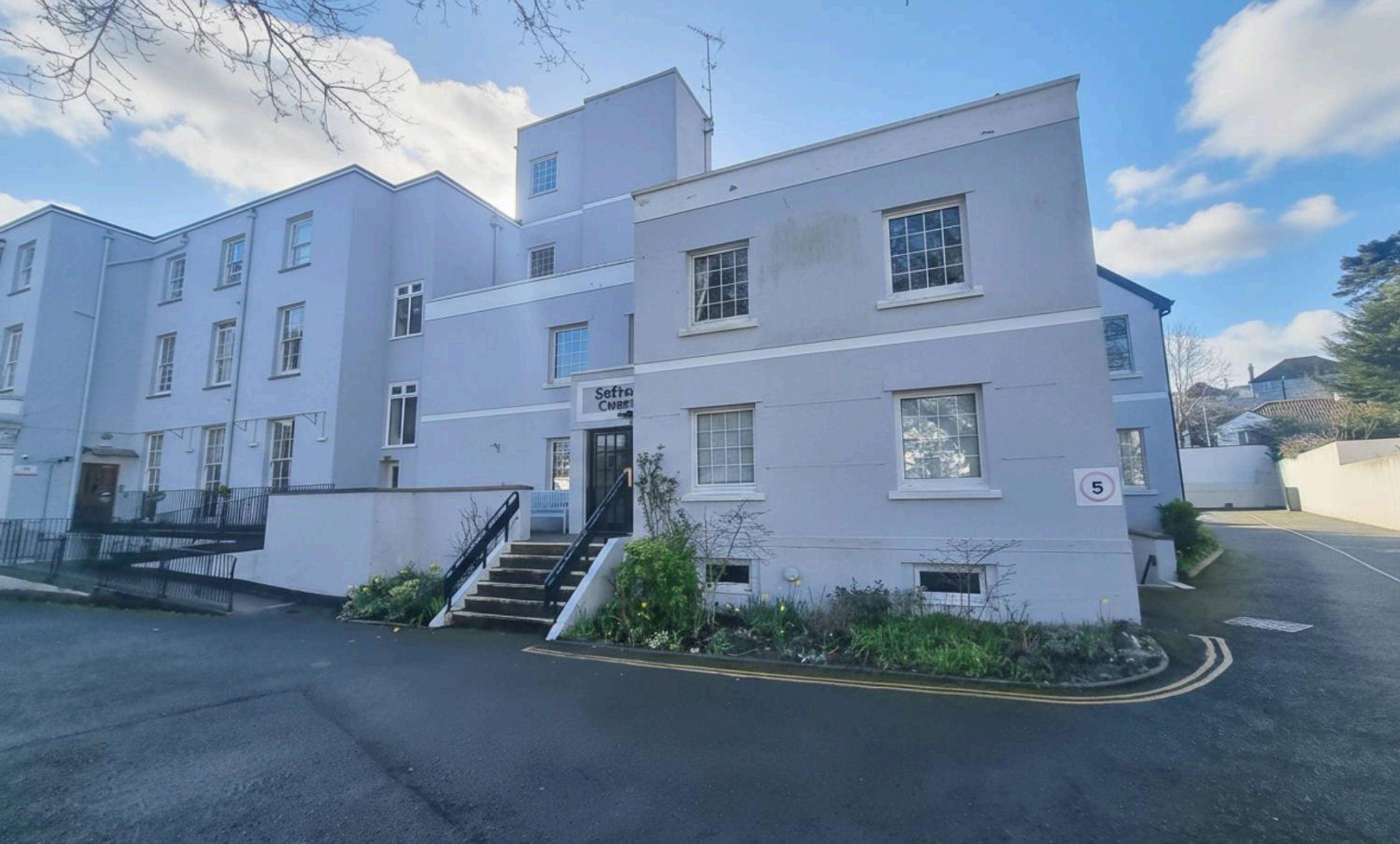
Flat 1, Sefton Court Plantation Terrace, Dawlish £80,000