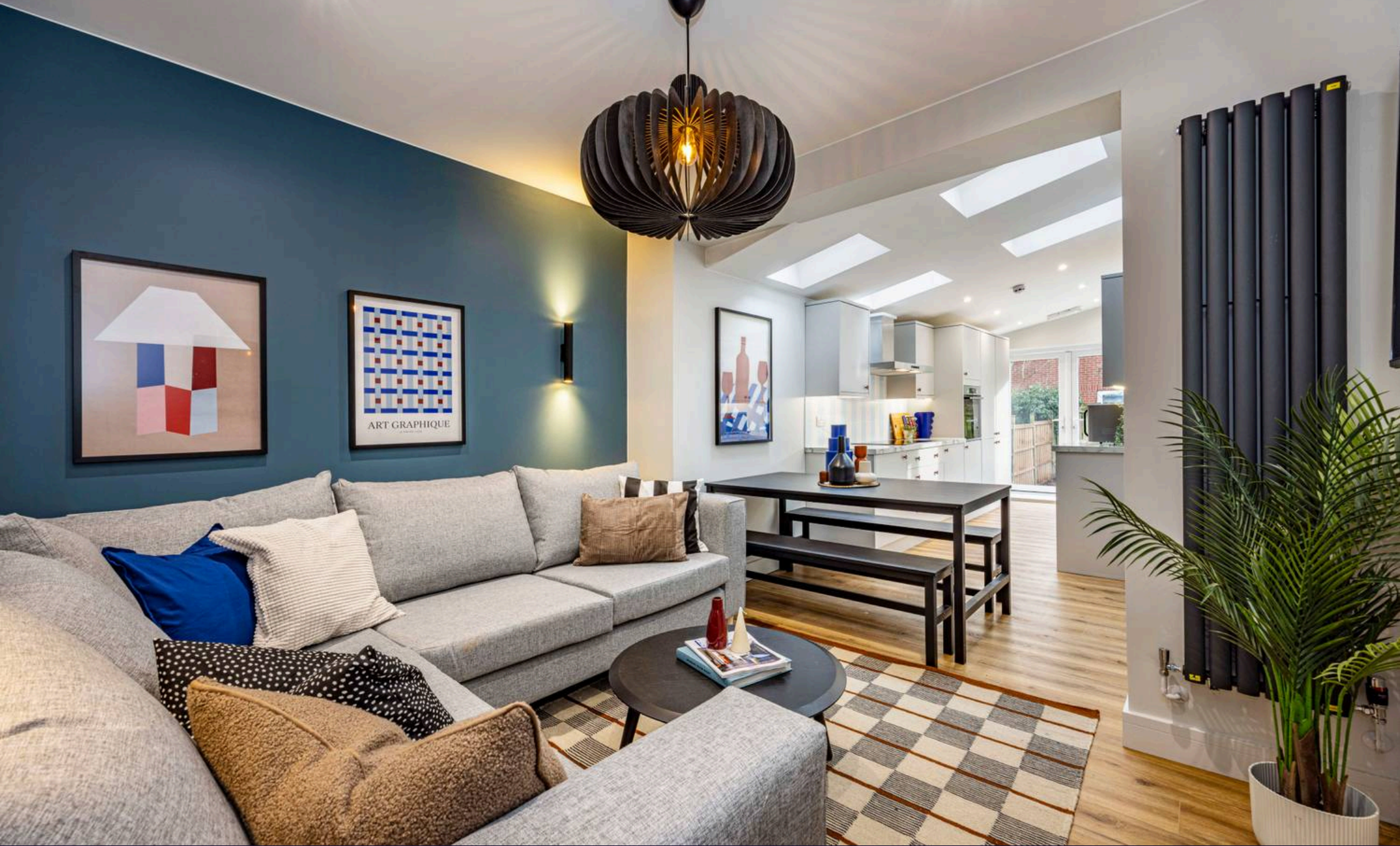
Room 2, Highfield Road, Nottingham £500 pcm