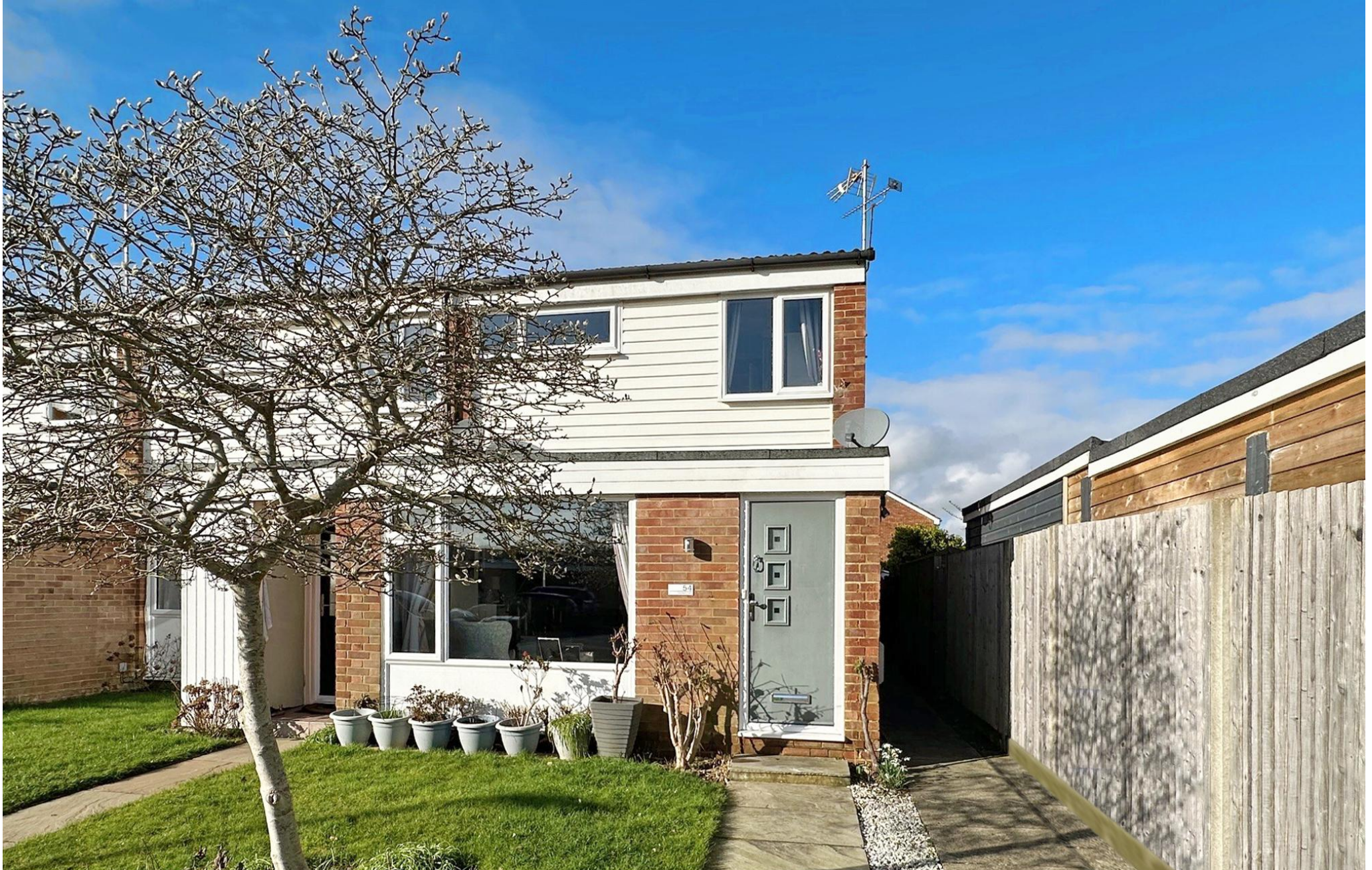
Smugglers Way, Barns Green, RH13 0JY. Guide Price £425,000 Freehold