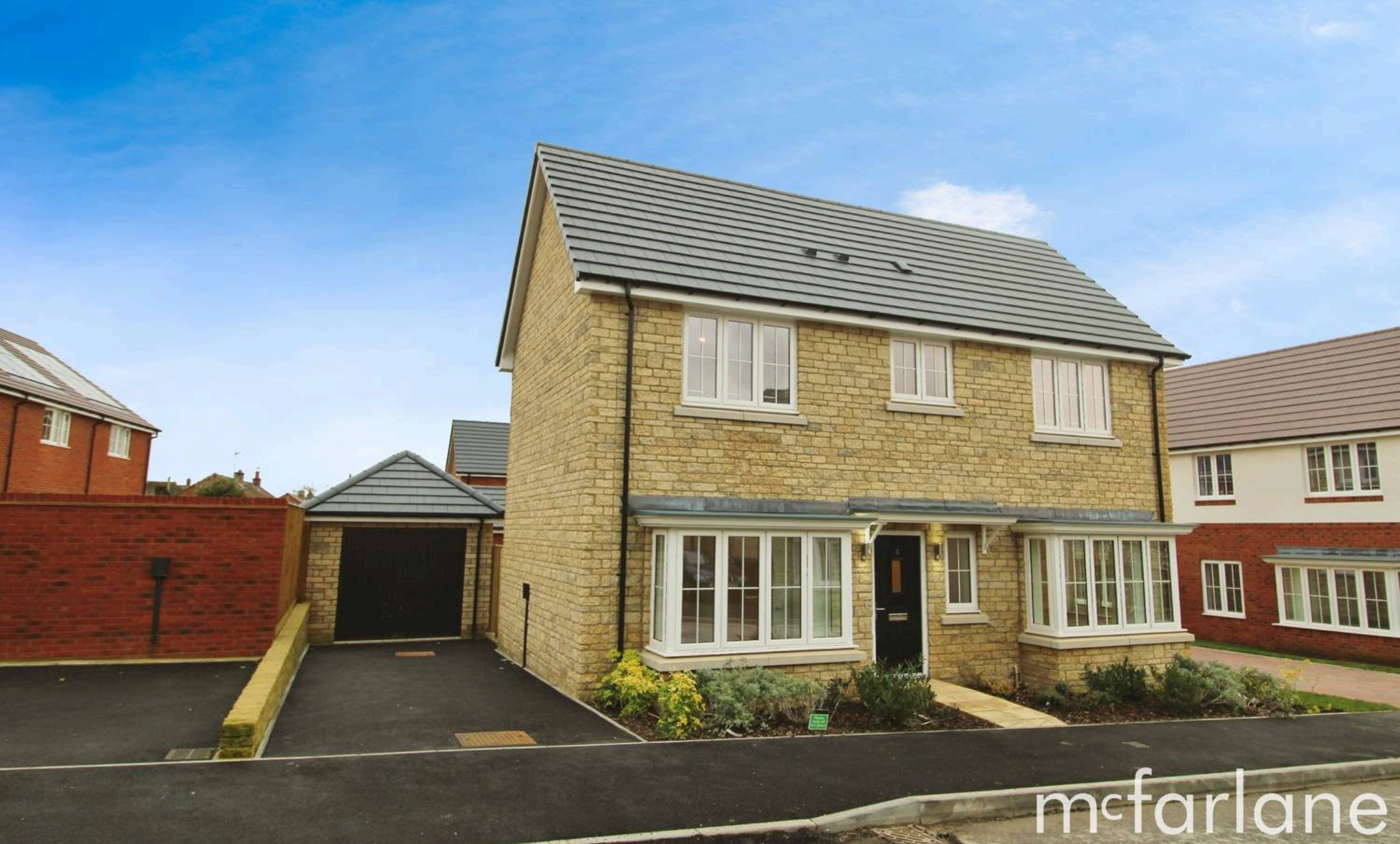
The Rowan , Restrop Road, Purton Swindon