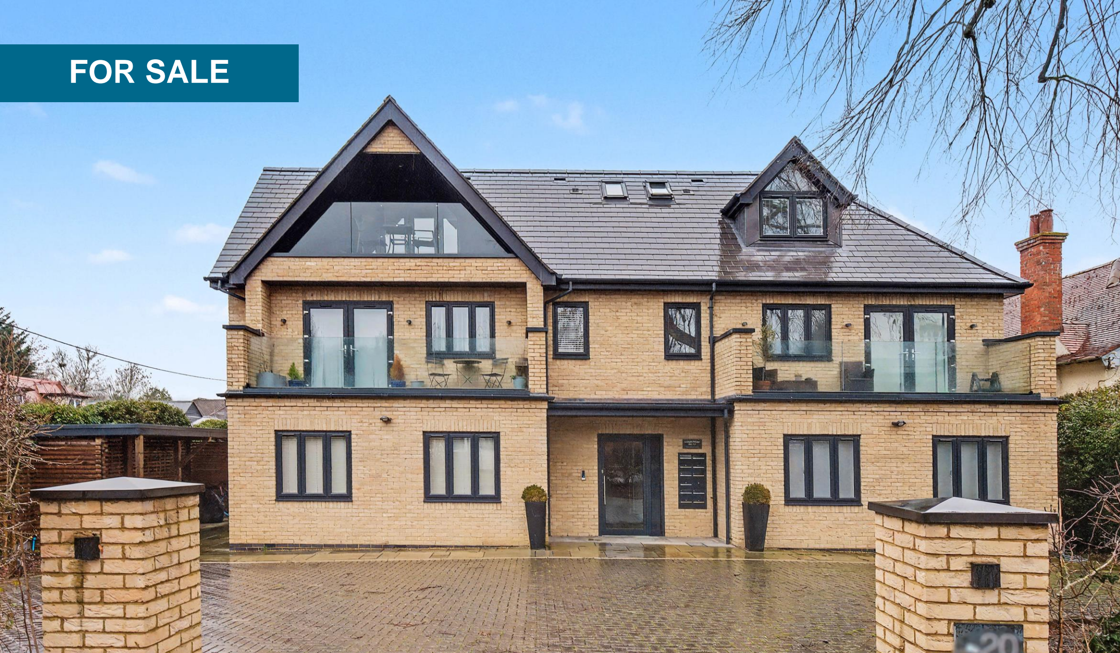
Linden House, Eynsham Road, Botley Guide Price £345,000